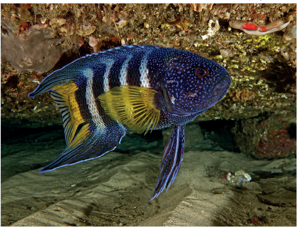
Figure 2: The eastern blue devil (Paraplesiops bleekeri) is a temperate cave-associated species that would not look out of place on a tropical reef. Brightly coloured and a prize sighting for divers; they are protected in New South Wales (Australia) waters because of their natural rarity and low abundance. (Photographer: John Turnbull: CC BY-NC-SA 2.0).

We know of no historical records in Australian museums or databases of eastern blue devil fish from deeper than 30 m either. Owing to a combination of their protected status and the complex terrain they inhabit, commercial fishers are unlikely to come across them, as trawling is avoided on these areas because of the risk of damage to nets. The vast majority of sightings and records of eastern blue devil fish are reported from divers and researchers. The accepted depth range of eastern blue devil fish and many coastal reef fish coincides with the recreational dive limits of ~30 m, despite the fact that