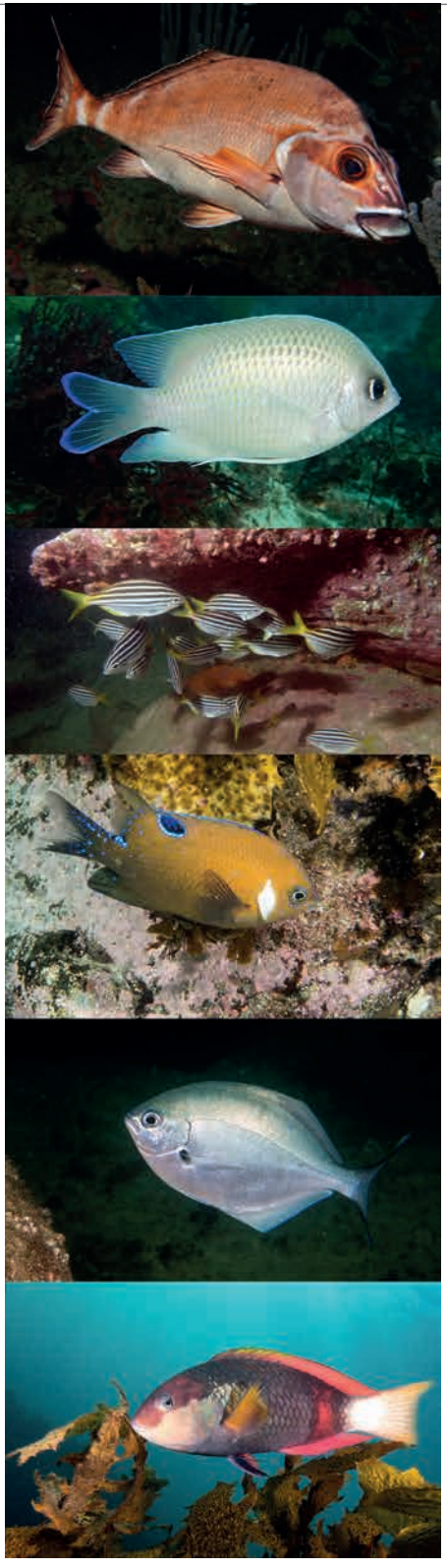
Figure 3: Five species (photos from top to second from the bottom are red morwong, immaculate damsel, mado, white-ear and silver sweep) that are common on shallow reefs and previously had an accepted depth range of <30 m were observed regularly on deeper reefs in this study (>50 m). Crimson-banded wrasse (bottom photo) was also observed outside their depth range on a small number of samples.

Once off the reef edge, the fish communities found on the surrounding sandy areas begin to change and are very different to those on the reef (Schultz et al. 2012). Our study area is no exception; the patch reefs at a depth of 50 m tend to be dominated by a range of more colourful or conspicuous species, whilst the surrounding sand habitats sampled in Fetterplace (2018) are dominated by flatheads (Platycephalidae), which use camouflage and burial in the sand to ambush prey. In contrast to the reef samples, none of the species encountered in comprehensive sampling on soft sediments at a depth of 50–60 m was outside its depth range (Table 1). Species that occur on sand are much more likely to have been caught in scientific or commercial trawling and the capture depths then included in the scientific records.