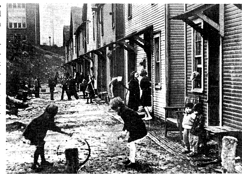
FIGURE ONE (above): One of many shots of prohibitory signs. FIGURE TWO (below): Children brought up in slums are contrasted to children in the new garden cities (see Figure Five, page 79).

Circumstances surrounding the appearance of The City —at the confluence of important new traditions in American documentary film and urban theory—