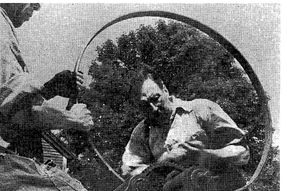
FIGURES THREE AND FOUR: Workers diminished by machines; craftsmen in harmony with tools and nature.

Lewis Mumford originally intended to do an outline for the film, but when he was called away to the West coast and Hawaii, the responsibility passed to Lorentz. The planners submitted what Ralph Steiner described as "two hundred pounds" of material for Lorentz to review, much of which undoubtedly stressed the garden city programs in which the planners were involved. Lorentz was slow to do the work, however, and when he ultimately turned out the outline—under Steiner's prodding after a few days of intensive work—it seems unlikely he would have had the time to pore over those materials. More likely, he was influenced in adopting the new town solution through his association with Rex Tugwell, whose own debt to the planners was also indirect.