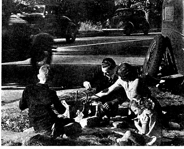
FIGURE SIX: Family recreation and the car. The Museum of Modern Art/Film Stills Archive.

a consistent purpose was not the promotion of the greenbelt which towns. practically run its course in the New Deal by 1939, but the redemption of cultural processes gone amuck. What the film makers seemed to sense was exactly the theorists were writing with a passion, that the city was the chief agent shaping the culture