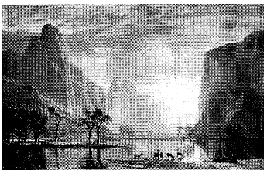
Albert Bierstadt, Valley of the Yosemite (1864). Oil on chipboard, 11\frac{3}{4} by 19\frac{1}{4} inches.

For example, the peculiar quality of the light in his small painting, "Valley of the Yosemite" (1863), is particularly striking. The source of