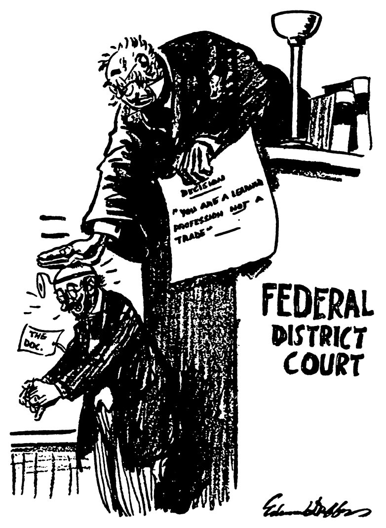
Oh, Most Upright Judge!

Cartoon in the Baltimore (Md.) Sun, July 27, 1939