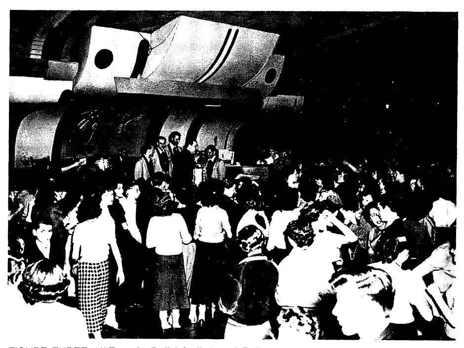
FIGURE THREE: Hi-Teen in Buffalo's Delwood Ballroom, late 1940s.

The Hi-Teen Club membership card illustrates both the existence of democratic procedures and their limitations. A signature on the card brought membership, and with it, the right to admission to the "meetings." But that same signature also acknowledged the club rules. The cards were first issued when the program moved to the Elks Club in 1947, and the four rules adopted at that time reflect the concerns of the Elks for their building. One rule limited membership to youths under 16; another required members to "conduct themselves as guests"; a third prohibited loitering in the lobby or entering any part of the Elks' Building except the ballroom and attached restrooms; and the fourth required a signature as acknowledgment of the other rules. In addition, these rules were enforced not by club members, but by a committee of WEBR and Elks personnel. <sup>39</sup> In short, Hi-Teen's commitment to democratic methods was a minimal one.