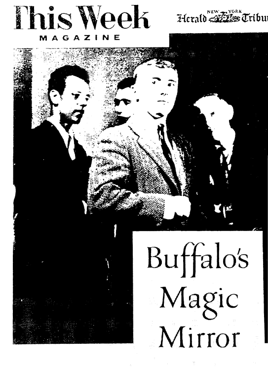
FIGURE FIVE: To encourage adherence to the voluntary Dress Right Code, some Buffalo schools installed 2-way mirrors and observed student behavior from behind them. This Week Magazine , November 23, 1958.

urged that "all recommended wear for girls should fit appropriately and modestly." Recommendations for boys—academic and vocational alike—were designed to eliminate soiled clothing, T-shirts and sweatshirts, and "extreme" shoe styles, with specific reference to the "motorcycle boots" so strongly identified with delinquent youth. Recommended wear for all boys included "khakis," a word of military connotation. Vocational students were allowed a greater degree of informality than their academic counterparts; they might wear a simple sport shirt with tie, while academic students were held to the higher standard of a "dress shirt" and tie or a "conservative" sport shirt and tie with suit jacket, sport coat, or sweater. 50