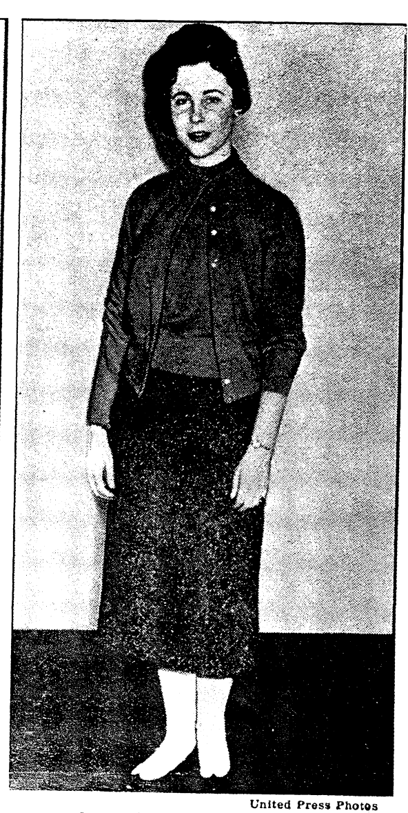
ejeaned sink behave better . . . . . when they're in ladylike dress