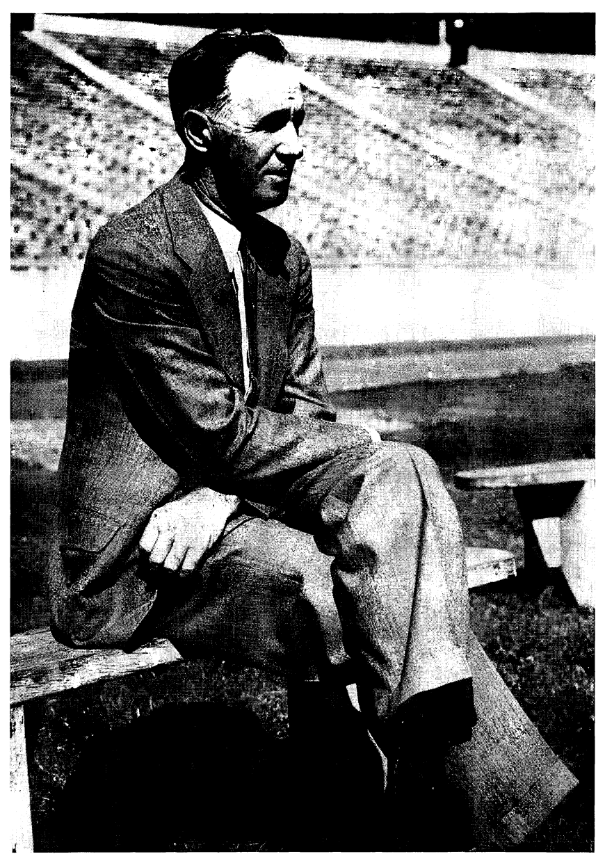
Figure 4: Wallace Wade, Coach of Duke University, 1930-42, 1946-50. Wade guided Duke to two Rose Bowl games.