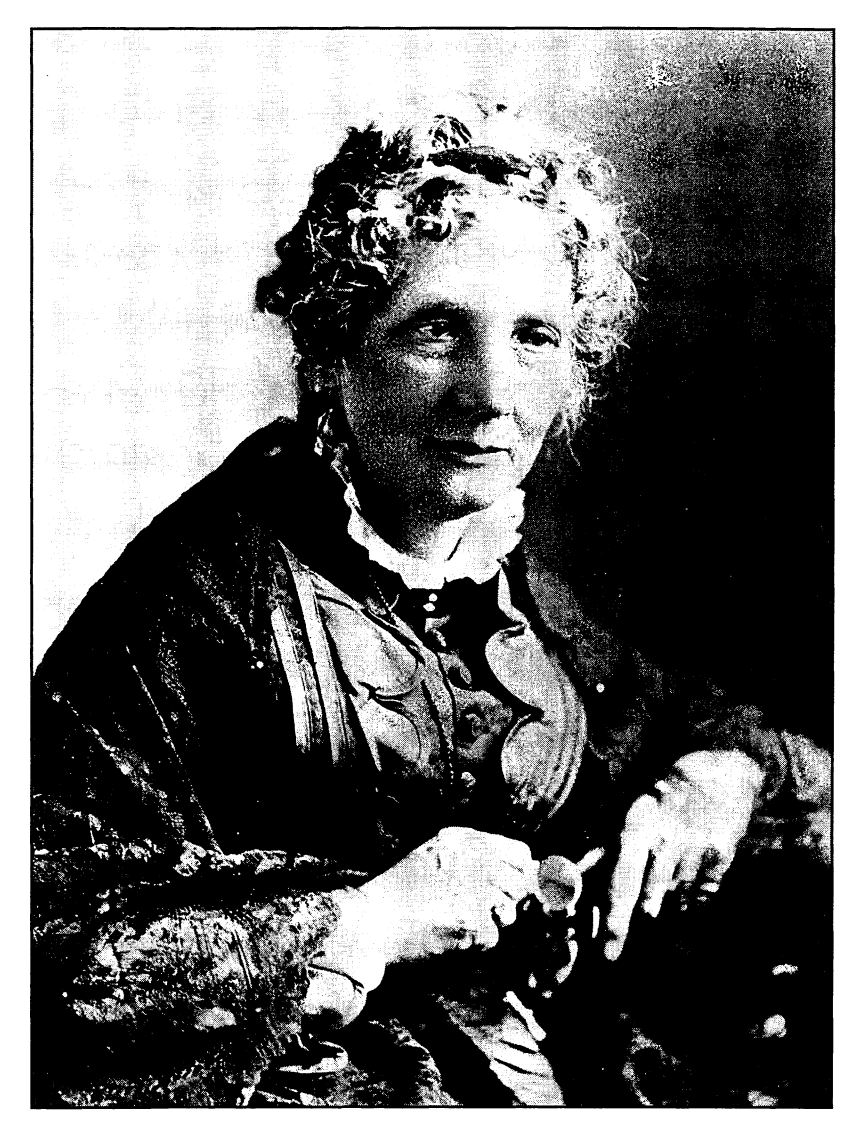
Figure 4: Harriet Beecher Stowe was the Atlantic 's most visible and valuable female contributor. She helped launch the magazine by lending her popular appeal to what publishers feared was a roster of mostly stodgy male contributors. Her role at the magazine set the tone for the editors' treatment of other women writers.