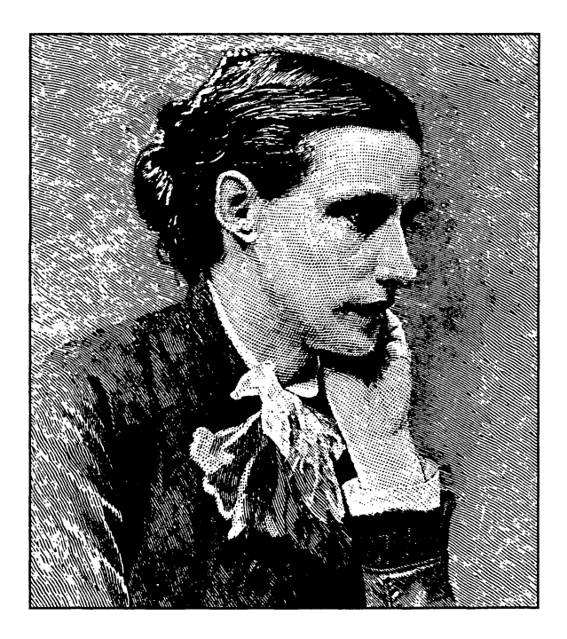
Figure 2: Elizabeth Stuart Phelps, like other women writers, felt encouraged to pursue serious ambitions as an artist when she was well-received by the Atlantic 's male icons. But their high expectations for her did not result in a lasting literary reputation.

In the second half of the nineteenth century, women writers, for the first time in American history, exhibited an ambition to be recognized not only by the American public but by the male editors, writers, and critics of the literary elite. When the Atlantic began publication in 1857, it provided an important testing ground for these new ambitions. Seeing their contributions in print next to Emerson and Longfellow gave women writers a new sense of opportunity and made them feel that they had arrived as serious writers. Elizabeth Stuart Phelps spoke for many when she recalled her early perception of the Atlantic: "I shared the general awe of the magazine at that time prevailing in New England, and, having, possibly, more than my share of personal pride, did not very early venture to intrude my little risk upon that fearful lottery." When her first story was accepted by the Atlantic in 1868, her friends voiced for her the amazement she felt at being placed in the company of established writers she so admired: "What! Has she got into the 'Atlantic'?" Her welcome reception at the magazine awakened new ambitions in her, as it did in the young Louisa May Alcott, who wrote in her journal in 1858 that she was beginning to feel confidence as a writer: "I even think