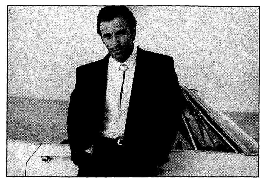
Figure 3. Front cover of "Tunnel of Love" (1987).