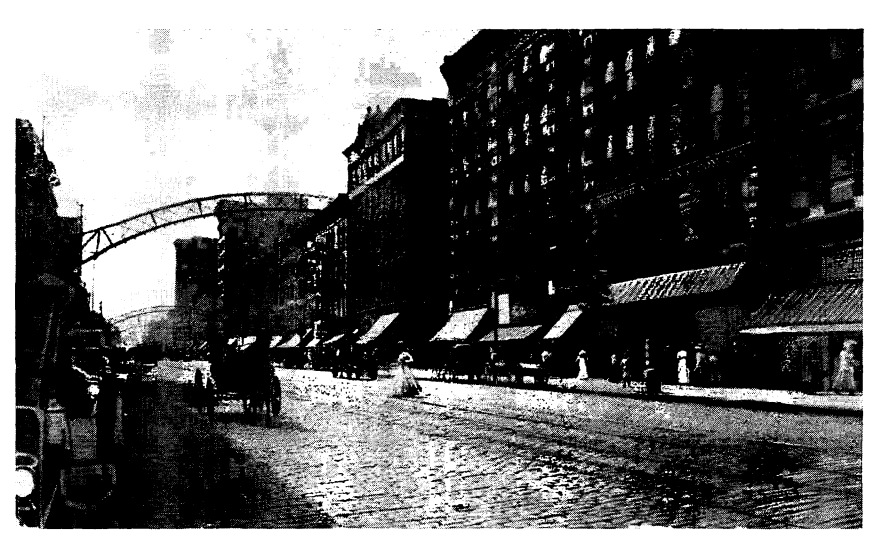
Downtown Columbus at the time of Thurber's youth.

alma mater of record and Yale (which awarded him an honorary degree and was nearer his Connecticut home) as his alma mater of choice.<sup>17</sup>