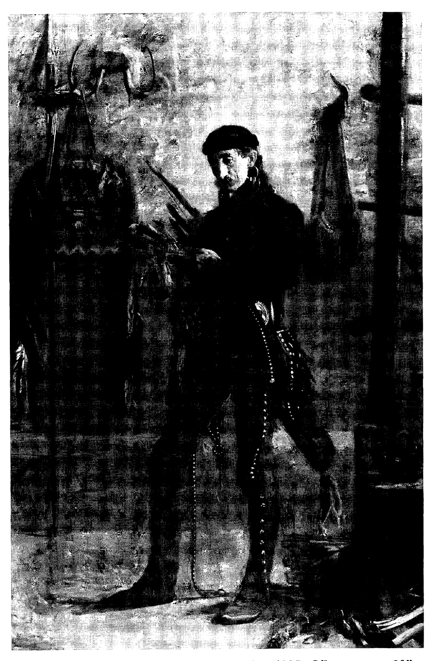
Figure 3. Portrait of Frank Hamilton Cushing, 1895. Oil on canvas, 90" x 60".