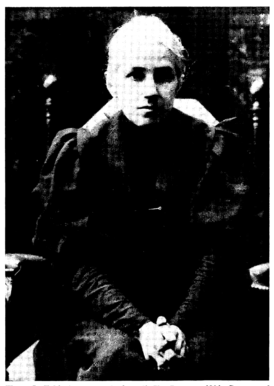
Figure 5. Eakins' photograph of Amelia Van Buren, c. 1891.

criticizes the materialism, thus represented, that threatens to swamp the person. Conventions of women's clothing in the period, Stuart and Elizabeth Ewen explain, were the antithesis of men's: "While men's clothing displayed an