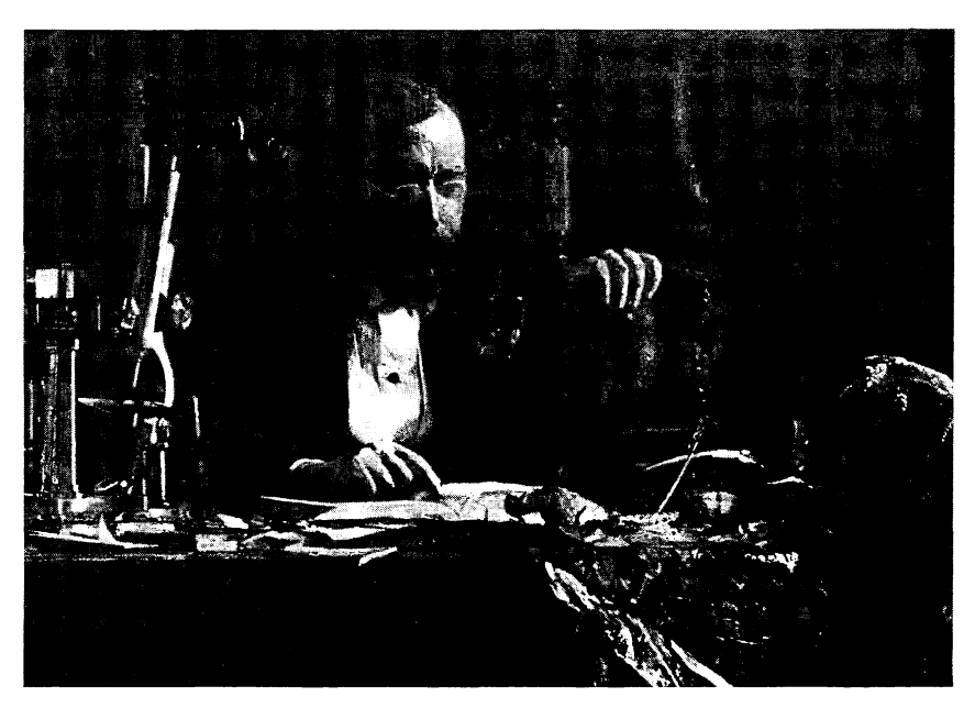
Figure 2. Portrait of Benjamin Howard Rand, 1874. Oil on canvas, 60" x 48".

The microscope, with its golden gleam and hard-edged precision of rendering, identifies the sitter as a champion of scientific truth, and contrasts sharply with the loosely-painted pink shawl, an emblem of domestic security. This symbolism is echoed and associated more directly with Dr. Rand in the gold edging and clean lines of the book before him and the hot pink of the carnation lying close beside this presumably scientific tome. The doctor's right hand rests on the book, marking his place, while the flower is positioned on the desk directly under his left hand. If these are the objects that through their careful placement in the painting Eakins tried to reconcile conflicting aspects of culture and the