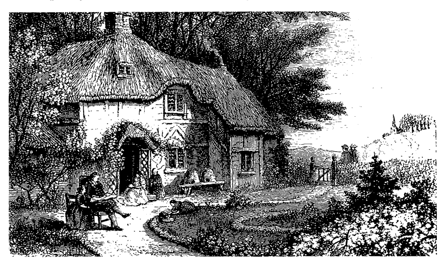
An illustration in Irving's sketch, "Rural Life in England," from the 1880 edition of The Sketch Book .

Finally, the literary references of American travelers in Britain had the effect of keeping a familiar landscape familiar. American expectations of Britain were often at variance with the realities of the nation at midcentury. Travelers came expecting to see rural cots, wimpling burns and quaint Dickensian characters. And they got what they came for. Americans reinforced through allusion the image of a placid rural England—the England, in short, of Irving's Sketch Book . Through the allusions they made—allusions which, as we shall see, actually shaped their itineraries in Britain—Americans shielded themselves from the contemporary realities of nineteenth-century Britain.