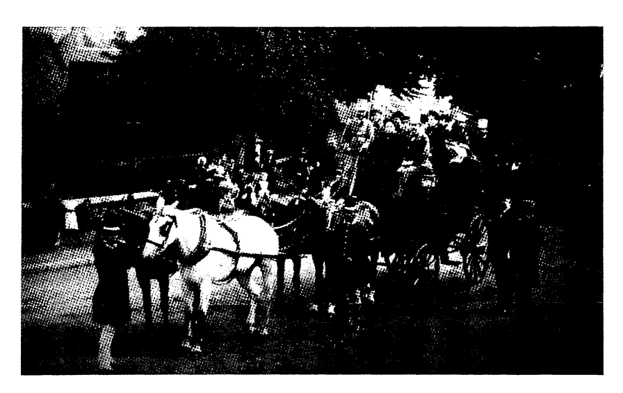
Andrew Carnegie and his traveling party atop the "Four-in-Hand" (1883). Carnegie is seated on the left in front, holding the whip.

program of American literary nationalism was to seize upon that sense of earliness as the basis for fresh and unimpeded creation. But these narratives of British travel show how many Americans in the age of Emerson perceived themselves as culturally belated, and how many of them sought to counteract that sense of belatedness through displays of assimilated reading.