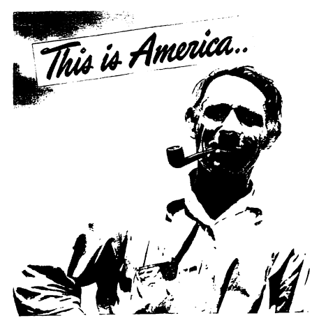
"Smile--man--smile. You're an American... free to speak . . . free to worship . . . free to work . . . free to live in your own way. Stay on the job. This is <u>your</u> America."