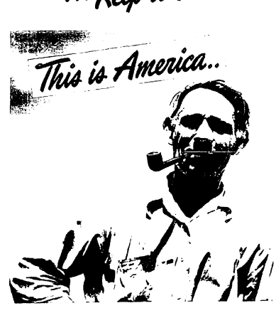
"Smile--man--smile. You're an American... free to speak... free to worship... free to work... free to live in your own way. Stay on the job. This is <u>your</u> America."