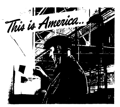
... where your thinking is appreciated ... where men work together, to do a better job — – to make a better product — – to build a better nation * This is <u>your</u> America