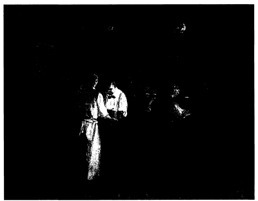
Figure 1: John Sloan, McSorley's Bar, 1912, Founders Society Purchase, General Membership Fund

plicitly question and sometimes explicitly reject the goals and values of industrial society."<sup>25</sup> At the saloon, the working man exercised autonomy over his life; he was beyond the reach of his employer and family. In 1913, between one and two million men in New York City spent a part of every day in drinking establishments. A growing number of Americans, however, believed that saloons exercised a sinister influence over private and political morality.<sup>26</sup>