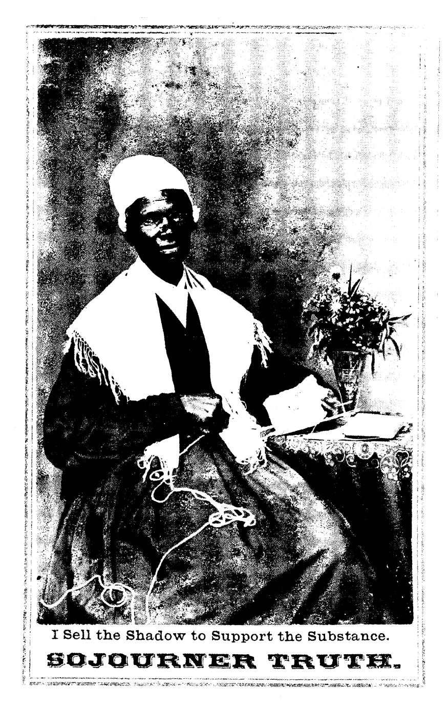
Figure 5: Sojourner Truth, 1864, carte de visite , photographer unknown. Photograph courtesy of National Portrait Gallery, Smithsonian Institution.