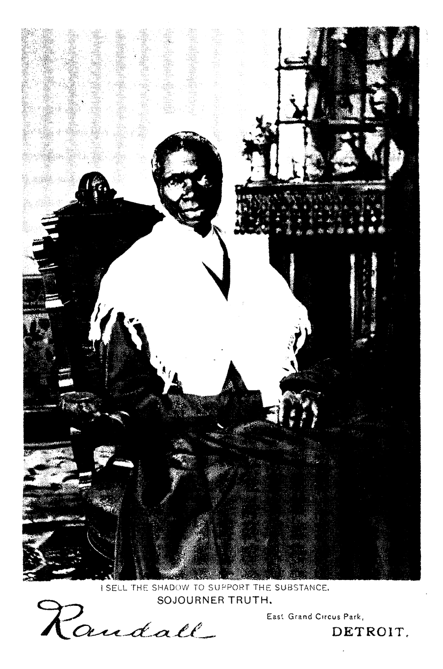
Figure 4: Sojourner Truth, ca. 1870, cabinet card, Randall studio, Detroit.