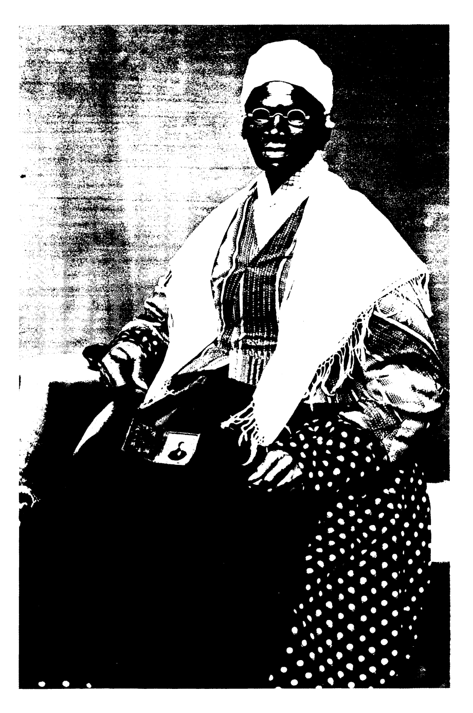
Figure 6: Sojourner Truth, ca. 1860s, format and photographer unknown.