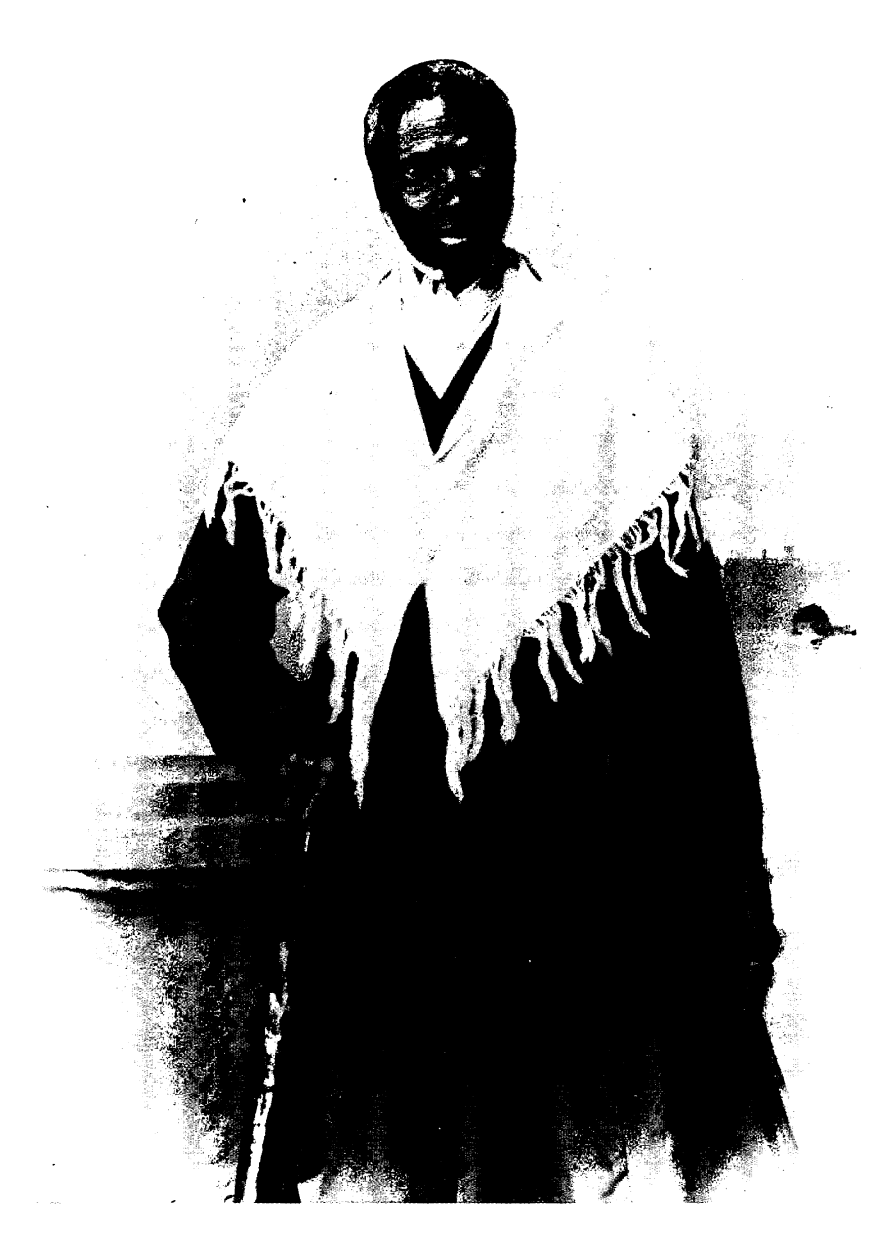
Figure 3: Sojourner Truth, 1864, cart de visite , photographer unknown. Photograph courtesy of the Burton Historical Collection, Detroit Public Library.