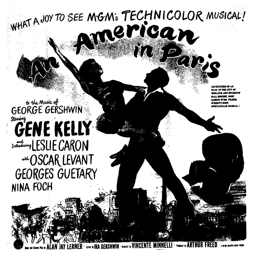
Figure 1: MGM publicity poster for "An American in Paris."

And like most stories of rebellion against one's fathers, expatriate narratives of Americans in Paris tend to be stories of filial disillusionment and patriarchal prohibition, stories that disrupt the coherence of familialized national myth with eruptions of oedipal crisis. At the same time, American popular culture has at times enlisted the expatriate theme in the service of shoring up nationalist ideology, such as may be witnessed in Vincente Minelli's 1951 musical An American in Paris, (Figure 1) a film that revels in a post-war political fantasy expressed chiefly through the idealized amalgamation of Gene Kelley's signature bold, robust ballet style and the feminine frailty of the young Leslie Caron, who, during the film's shooting, was still recuperating from emotional and physical distress suffered during the war, a condition that required her to work according to a reduced schedule. The film's plot is organized around what at first seems an impossible romance: Jerry Mulligan, a former G.I., decides to remain in Paris after the war to study painting. While struggling for recognition,