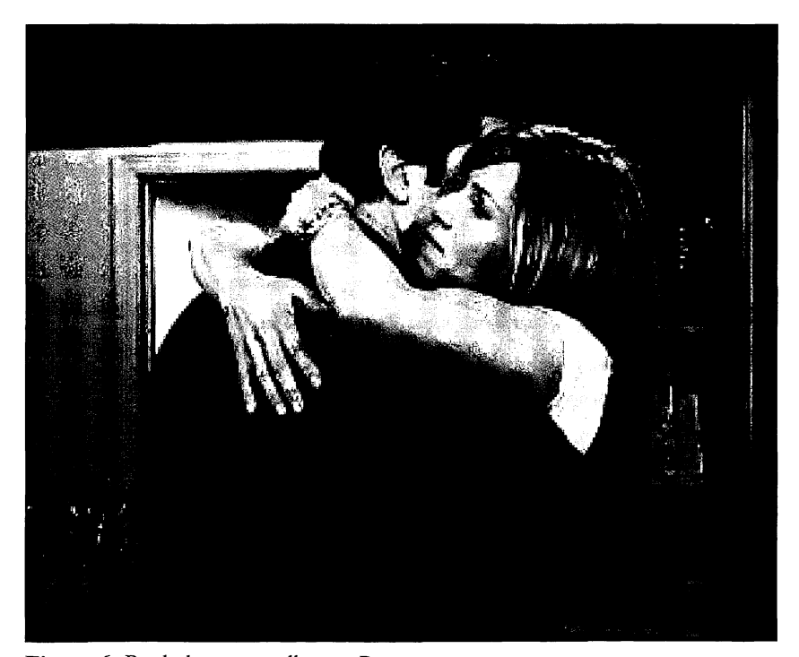
Figure 6: Rachel says goodbye to Ross.

Rachel's public act of forgetfulness and Carrie's public loss of consciousness are fitting metaphors for the disavowal of "the changing shades of light and dark," or for resistance to the psychological pressures to conform to the collective performance of national unity and to the state's insistence on a simplified "us vs. them" narrative with which to make sense of the new national order that arose after the World Trade Center attacks. Like Rip Van Winkle's 20-year nap, Carrie's swoon becomes the fundamental American physiological response to the ideological stress that is sub-textualized in Alek's invitation to resume Vincente Minelli's dance of empires, past and present, with New York's Lincoln Center here providing the impressionistic backdrop for the unnatural romance of political antagonists. Her collapse expresses a short-circuiting of impulses, a conflict which simultaneously reaches for the hand of the other while performing the compulsory loss of memory—not of the past, but of the present moment that was the traumatic basis of post 9/11 national consensus building. This performance circumvents the alienating dilemma of having to see oneself through the eyes of a world outside—a world that acknowledges evil, and yet still dances. And ultimately. Carrie does dance with Alek, although it only after she has changed the set and positioned Alek under the harsh fluorescent lights of a