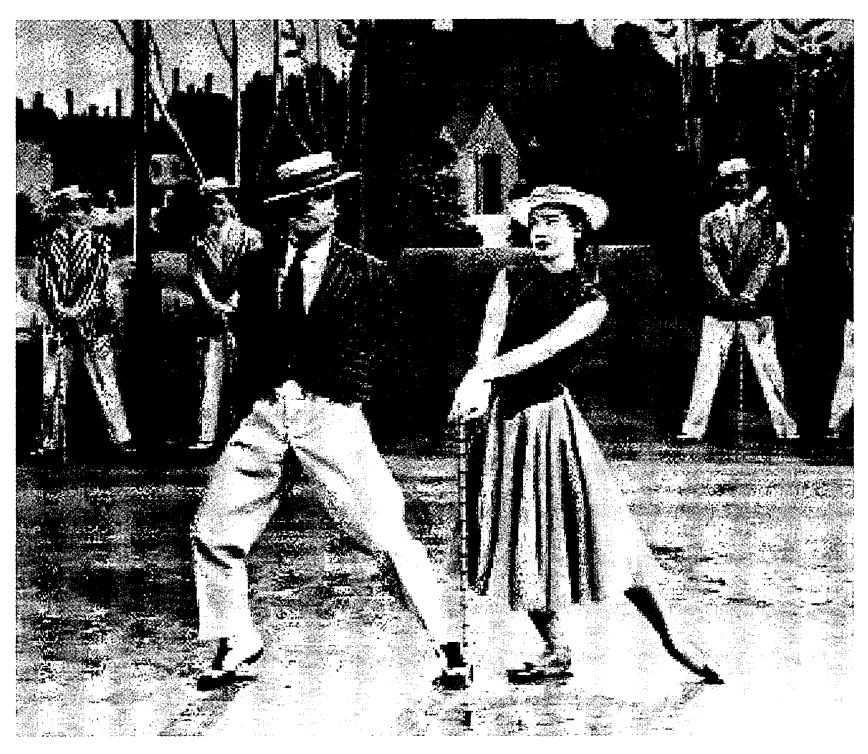
Figure 2: "Ballet," Gene Kelly and Leslie Caron.

The opening ballet sequence in particular, which features Kelly at the Place de la Concorde, is a kaleidoscopic projection of historical discourses of desire (figured as alluring French vixens), militarism (the advancing French army), imperialism, and colonialism (in the form of a lone African in exotic native dress who interrupts Kelly's exuberant romp across the plaza with a fleeting, ominous glare) onto the monumental simulacra of Paris Disneyfied. Kelly's wide-eyed wonderment functions as an assertion of American innocence. His