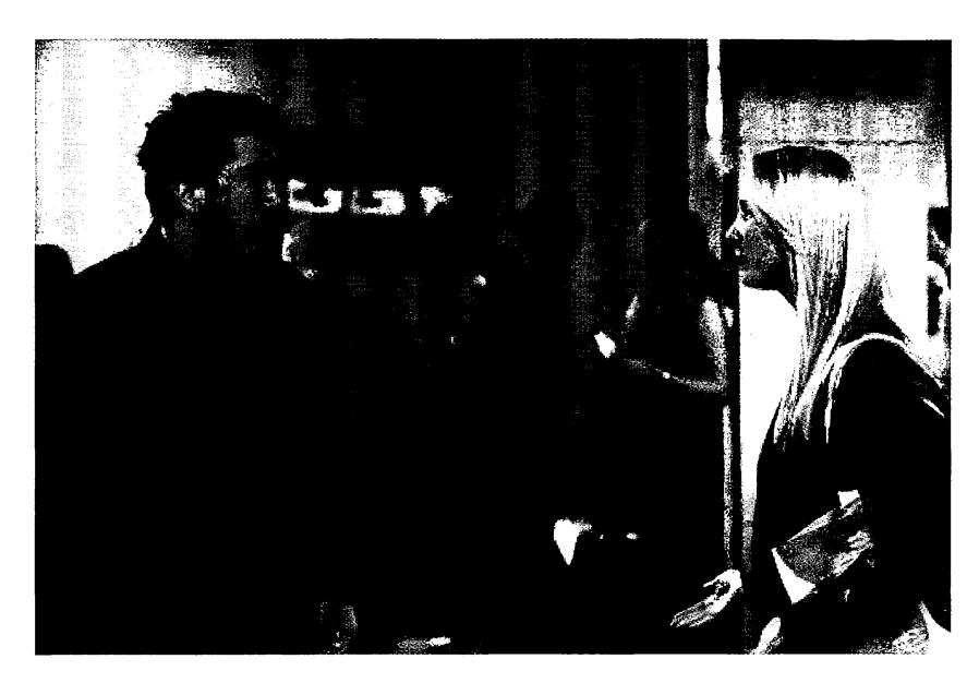
Figure 8: Phoebe and Ross at the airport, in search of Rachel.