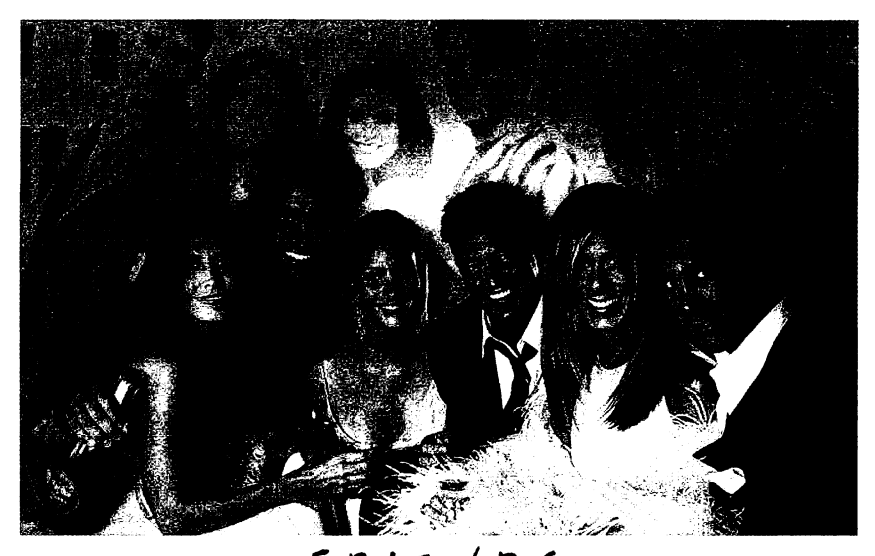
F·R·1E·N D·5 2-Hour Finale 8/7pm Thursday, May 6<sup>th</sup> SINBC