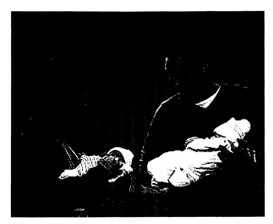
Figure 9: Chandler and Monica, parents at last, with adopted twins.

Brad Pitt defined the discursive parameters within which Friends fans were encouraged to bring closure to this chapter in television history and, at the same time retain an emotional connection to the female celebrities whose lives would now presumably enact the fantasies of familial validation that they performed on the set.