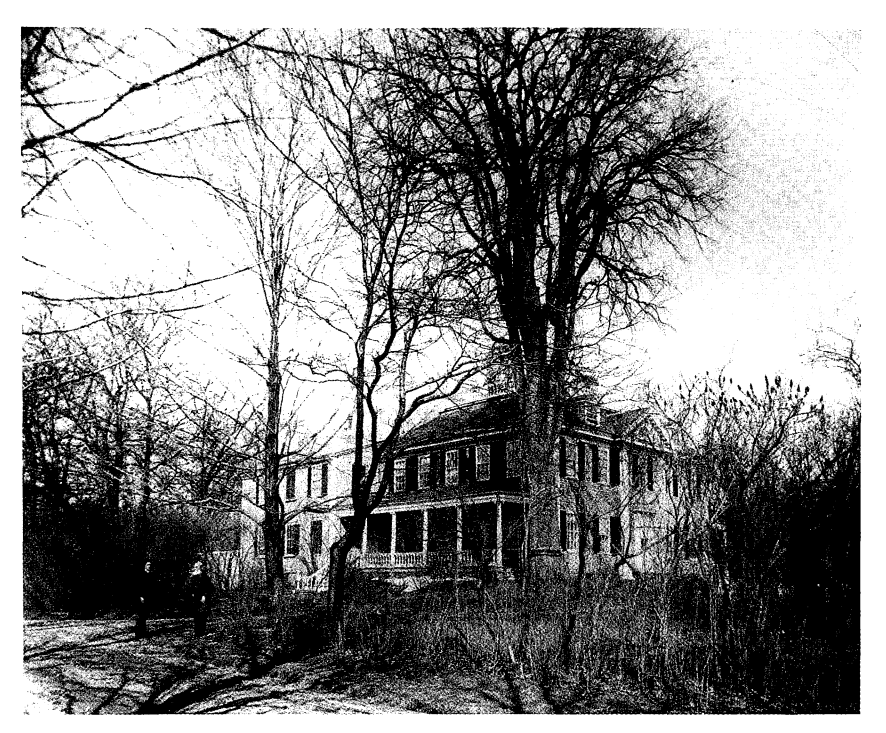
Figure 1: Photo of Longfellow House front facade and west side. Probably late-nineteenth century.

Vernon Ladies Association, historic preservation efforts enabled women to situate themselves as guardians of the country's heritage and morals. In the 1890s, patriotic societies such as the Mayflower Descendants and the Daughters of the American Revolution—to which Alice belonged—lobbied to protect venerated sites from possible destruction.<sup>19</sup>