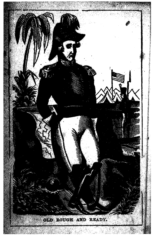
Figure 2: Sketch of General Zachary Taylor, Old Rough and Ready, from the Rough and Ready Songster .

of the Mexican male. It is not enough for Anglo soldiers to turn suitor and woo Mexican women, they must test their mettle on the battlefield as well. White male panic turns Mexican foes into one of two images: the fearsome, barbaric heathen represented by Generals Santa Anna and Ampudia, who rape women and order decapitations, and the effete dandy, also represented by General Santa Anna, whose moral character and fortitude have degenerated through overindulgence in luxuries. The rhetoric surrounding the U.S.-Mexican War, which manifested itself in contradictory attacks on the enemy's masculinity, reappeared over fifty years later in the Spanish-American War, targeting Spanish soldiers. In Kristin Hoganson's analysis of the gendered politics towards Spain that attended the Spanish-American War, she writes of the seemingly contradictory attacks on the enemy's masculinity: "Like the stereotypically savage Spaniards, the seemingly childlike and feminine Spaniards seemed to exemplify perverted gender roles."<sup>65</sup>