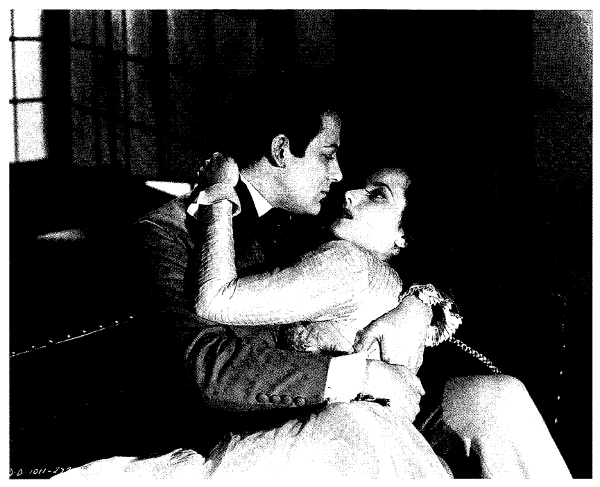
Figure 1: Merle Oberon's "George Sand" made love to Cornel Wilde's "Frederic Chopin" in the 1945 Columbia release, A Song to Remember.

counterattack against Axis invasion. These newly mandated resistance—or "conversion" films, as scholars have called them—were to focus the "average" filmgoers' attention upon the basic choices which they must make regarding the key ideological and political problems of the war.<sup>4</sup>