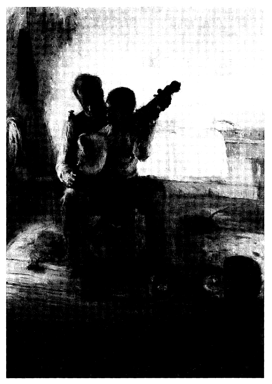
Figure 4: Henry Ossawa Tanner, The Banjo Lesson (1893), oil on canvas.