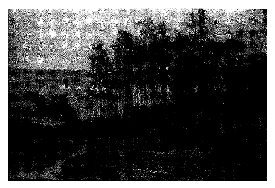
Figure 3 : Henry Ossawa Tanner, Edge of the Forest (1893). Courtesy of N.N. Serper, Rosenfeld Fine Arts, New York.

Obviously, Tanner believed that his position as an insider empowered him to represent African American life in a way that had never been seen before. In countering stereotypes of African American experience, he was claiming the right of racial self-representation. But this new work could also be an effort to extend what had been done already by artists like Thomas Hovenden and Eakins to represent African American experience with dignity and sympathy. Tanner's ambition was to wrest the power of representation away from whites, and he saw that he was empowered to represent African American life from the inside. As an insider he believed that he had an imaginative access to and a sympathy with his subjects that even the most well-intentioned and knowledgeable white artists of the period lacked.