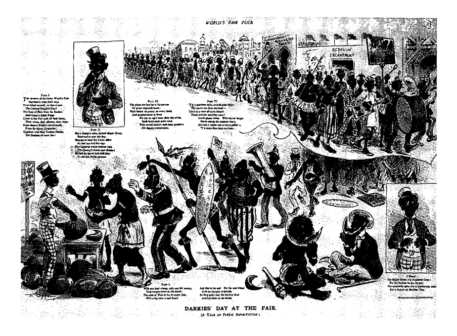
Figure 2: Frederick Burr Opper, "Darkies' Day at the Fair," from Puck (August 21, 1893).

Until at a turn all eyes discern Those melons DRIPPING COLD. Teeth gleam white. With carver bright Forth stands the tempter there. He slits a melon and starts a-sellin-'Tis more than flesh can bear.