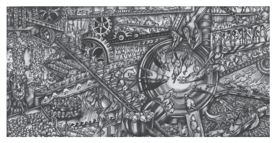
Figure 2: Sue Coe, Factory Pharm, (suecoe copyright 2009).

that they rethink their taste for the products of industrial agriculture. Sinclair famously captured this dissonance in reflecting on reception of The Jungle : "I aimed at the public's heart, and by accident I hit the stomach" (Sinclair 1906b, 594).