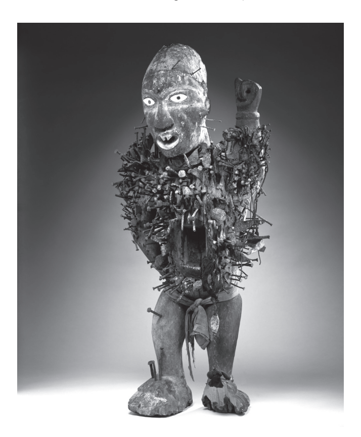
Figure 2: Nkisi Nkondi (Nail figure) , c. 1880–1920. Wood, pigment, iron, ivory, cotton, and other materials, H: 31½ × W: 15½ inches.

Stout began thinking about African connections and collected objects in art, when as a ten-year-old girl, she saw first saw an example of an nkisi nkondi at the Carnegie Museum of Art in Pittsburgh. Their system of cataloging was not that sophisticated, as a visitor would not necessarily know the object's original purpose. While the full meaning of the Carnegie nkisi nkodi nail figure alluded the artist in her youth, the recognition of its power stayed with her. Stout partially credits Robert Farris Thompson's book Flash of the Spirit as one of her early influences in incorporating African elements within her work (the same book with the definition of funk quoted above). Stout referred to this book