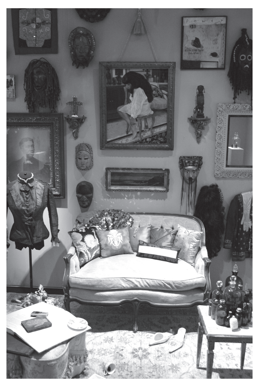
Figure 4: Renée Stout, The Thinking Room , (2005 - ongoing). Installation at Hemphill Fine Arts and the artist's home, Washington, DC.