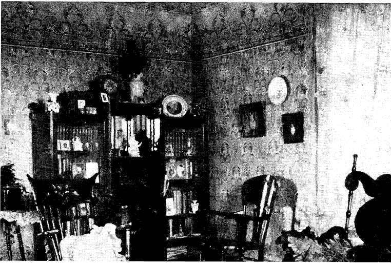
FIGURE FOUR: Interior of a Kansas residence, location and date unknown.