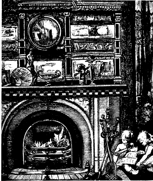
FIGURE TWELVE: "The Living-Room," from Clarence Cook, The House Beautiful (New York: Charles Scribner's Sons, 1877; reprint ed. 1881), 127.