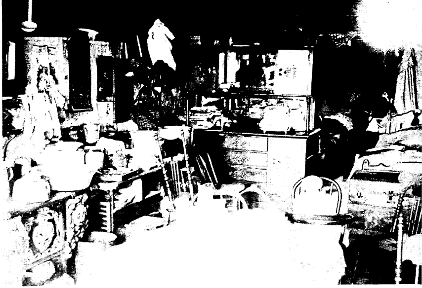
FIGURE ONE: Interior of dugout in Ford County, Kansas.

purpose of this article, then, is to explore the cultural role of women in the frontier in relation to the physical arena of domesticity. 3