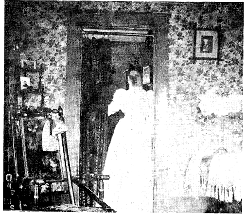
FIGURE THREE: Interior of home in Wolfville, Kansas, ca. 1880s.