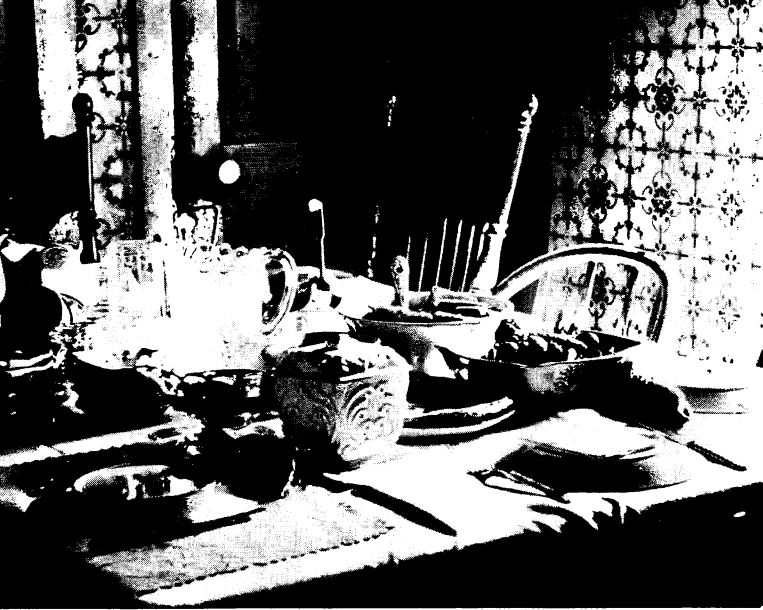
FIGURE FIVE: View of kitchen in unidentified residence.