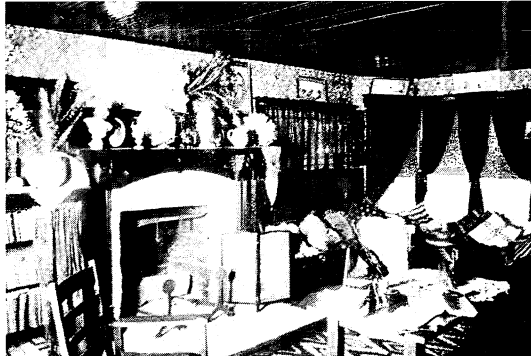
FIGURE FOURTEEN: Living Room of the Rob Roy ranch, Kansas, ca. 1890s.