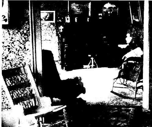
FIGURE FIFTEEN: Unidentified residence, ca. 1880s.

very cultured people.” 11 Other people claimed that being rough around the edges was a positive quality. An article in the Manhattan (Kansas) Nationalist on 13 January 1871, claimed that Kansas women were not ignorant of fashion in house furnishings, but that the family and its needs took precedence over the whims of outsiders.