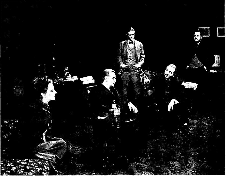
FIGURE TWO: Lillian Hellman's The Little Foxes : Regina on the periphery of the male domain.

act, and which spur her on to more devious scheming. With each new underhanded plan, Regina is excluded from the investment. Indeed, though Horace claims social responsibility as his reason for denying his wife her investment, his morality does not prevent him from aiding Ben and Oscar in order to spite Regina. That Regina finally gains a controlling interest is only proof that she has learned to beat the men at their own game.