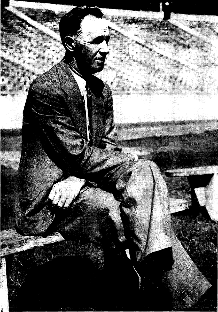
Figure 4: Wallace Wade, Coach of Duke University, 1930-42, 1946-50. Wade guided Duke to two Rose Bowl games.