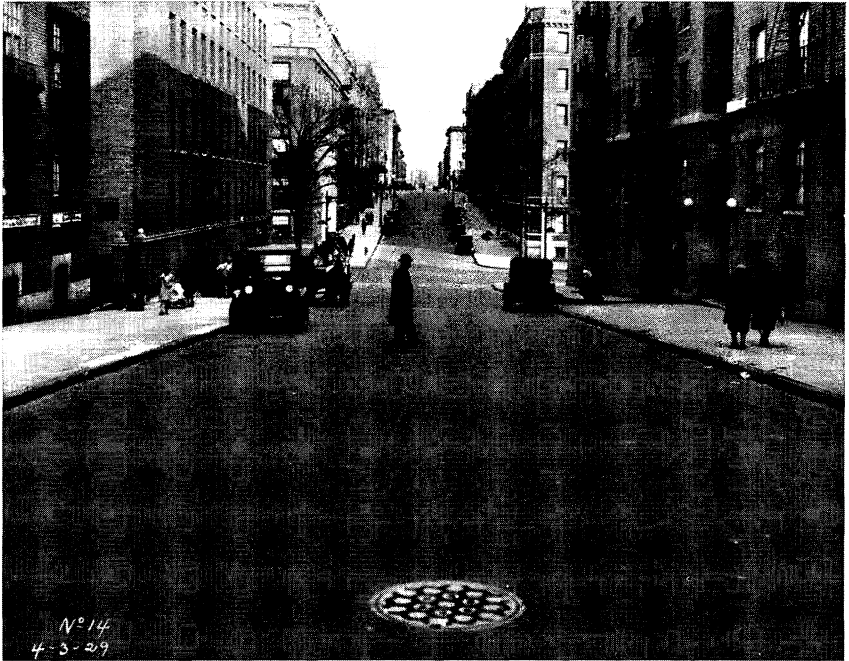
Figure 1: Off of Park Avenue, 1929. A single man stands not far from the lone tree on an Upper East Side Manhattan Street.

Lily Bart, the tragic heroine of Edith Wharton's House of Mirth (1905), begins her long fall from the heights of New York's "new" wealthy society with a moment of respite in the company of Mr. Lawrence Selden beneath the trees of a small street just north of Grand Central Station. The moment is brief, but it is a wonderful foreshadowing metaphor for the rest of the novel, for Lily soon finds little respite from the raw heat of 1880s New York's vicious social world. She realizes only too late that it is Lawrence Selden, the aloof bachelor, who can provide relief from this world. In the end, she finds peace in the calming influence of sleep medicine, which lulls her into a never-ending slumber.