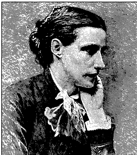
Figure 2: Elizabeth Stuart Phelps, like other women writers, felt encouraged to pursue serious ambitions as an artist when she was well-received by the Atlantic 's male icons. But their high expectations for her did not result in a lasting literary reputation.

In the second half of the nineteenth century, women writers, for the first time in American history, exhibited an ambition to be recognized not only by the American public but by the male editors, writers, and critics of the literary elite. When the Atlantic began publication in 1857, it provided an important testing ground for these new ambitions. Seeing their contributions in print next to Emerson and Longfellow gave women writers a new sense of opportunity and made them feel that they had arrived as serious writers. Elizabeth Stuart Phelps spoke for many when she recalled her early perception of the Atlantic : “I shared the general awe of the magazine at that time prevailing in New England, and, having, possibly, more than my share of personal pride, did not very early venture to intrude my little risk upon that fearful lottery.” When her first story was accepted by the Atlantic in 1868, her friends voiced for her the amazement she felt at being placed in the company of established writers she so admired: “What! Has she got into the ‘ Atlantic ’?” Her welcome reception at the magazine awakened new ambitions in her, as it did in the young Louisa May Alcott, who wrote in her journal in 1858 that she was beginning to feel confidence as a writer: “I even think