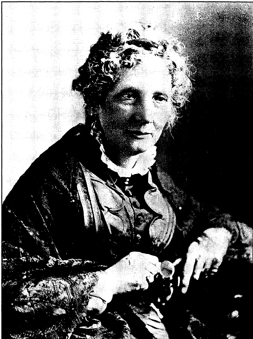
Figure 4: Harriet Beecher Stowe was the Atlantic's most visible and valuable female contributor. She helped launch the magazine by lending her popular appeal to what publishers feared was a roster of mostly stodgy male contributors. Her role at the magazine set the tone for the editors' treatment of other women writers.