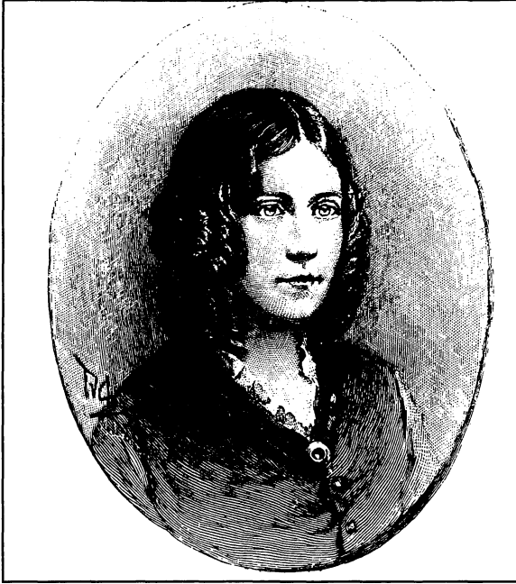
Figure 3: When Harriet Prescott Spofford began her literary career in the pages of the Atlantic in 1858, she received more encouragement than any other female contributor. She was hailed by the editors and reviewers as a genius in waiting, but she waited in vain for the literary immortality they predicted for her. [From William Dean Howells, Literary Friends and Acquaintance . New York: Harper & Brothers, 1901.]

even the poor opportunities allowed them. They have employed the alphabet, as Molière said, chiefly in spelling the verb Amo . . . . And their conception, even of Art, has been too often on the scale of Properzia de Rossi, who carved sixty-five heads on a walnut, the smallest of all recorded symbols of woman's sphere. 9