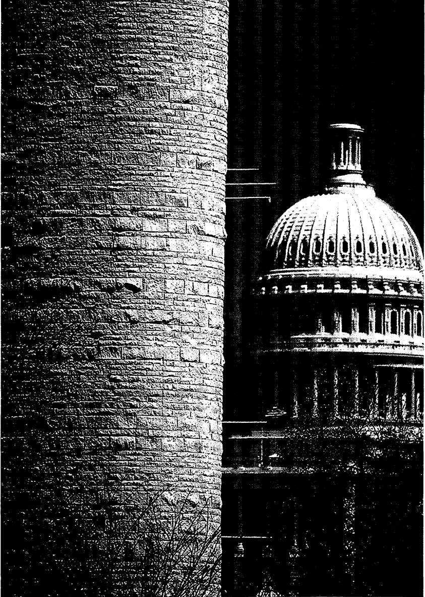
Figure 1: View of the southwest corner of the NMAI and the United States Capitol Building. Photo by Maxwell MacKenzie. Copyright 2004, Maxwell Mackenzie. Reprinted with the permission of the National Museum of the American Indian.”