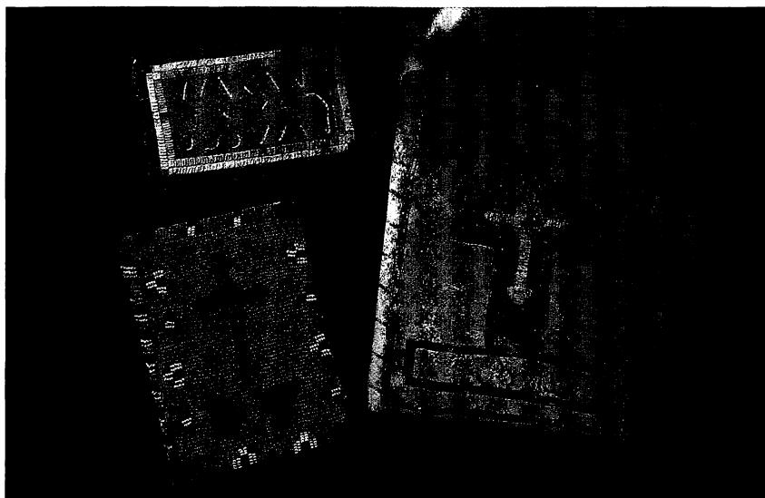
Figure 4: A close up of Sioux bibles and hymnals on display in the Our People's exhibit. Photo by Walter Larrimore, NMAI. Copyright Smithsonian Institution/National Museum of the American Indian. Reprinted with the permission of the National Museum of the American Indian.

ended in 1871). Another wall displays over 100 different bibles translated into 75 indigenous languages, and reflects upon the contradictory history of Christianity in the Americas, used simultaneously as a tool of control by colonial occupiers and an inspirational resource by Native Americans.