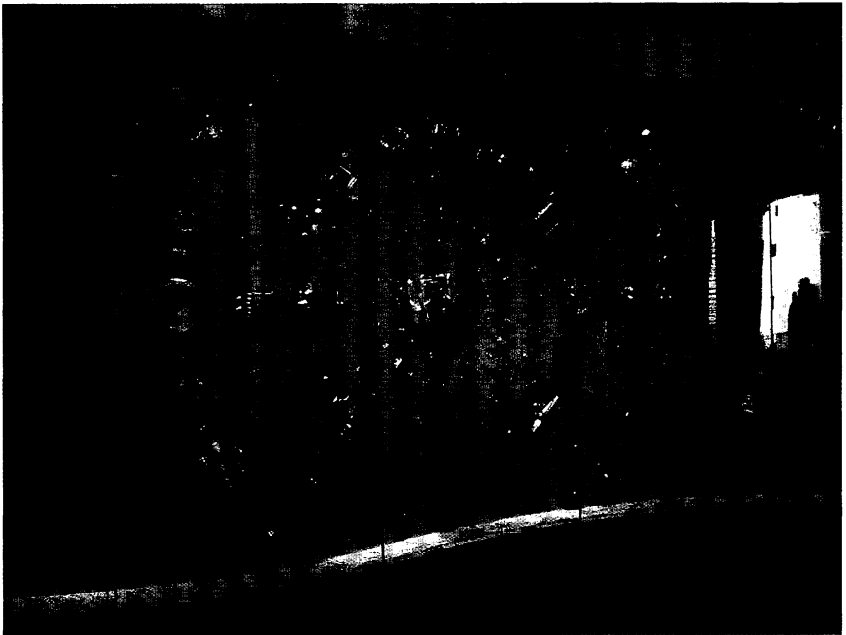
Figure 3: The “Gold Wall” in the Our People ’s exhibit. Photo by Leonda Levchuk, NMAI. Reprinted with the permission of the National Museum of the American Indian.”

In the center of the Our Peoples exhibit is an installation art piece by Edward Poitras (Saulteaux/Metis) surrounded by a pair of curved walls that form a circle. On the outside of the walls are various displays that address not only Native American history, but also the meanings and myths associated with their history. “Symbols of Liberty” illustrates the use of images of Native Americans on money, noting that American Indians eventually became portrayed as symbols of liberty, but only after having been displaced and dispossessed. Another display called “Stated Intentions” allows visitors to see the actual treaty documents that were collected and signed during the era of treaty making (which