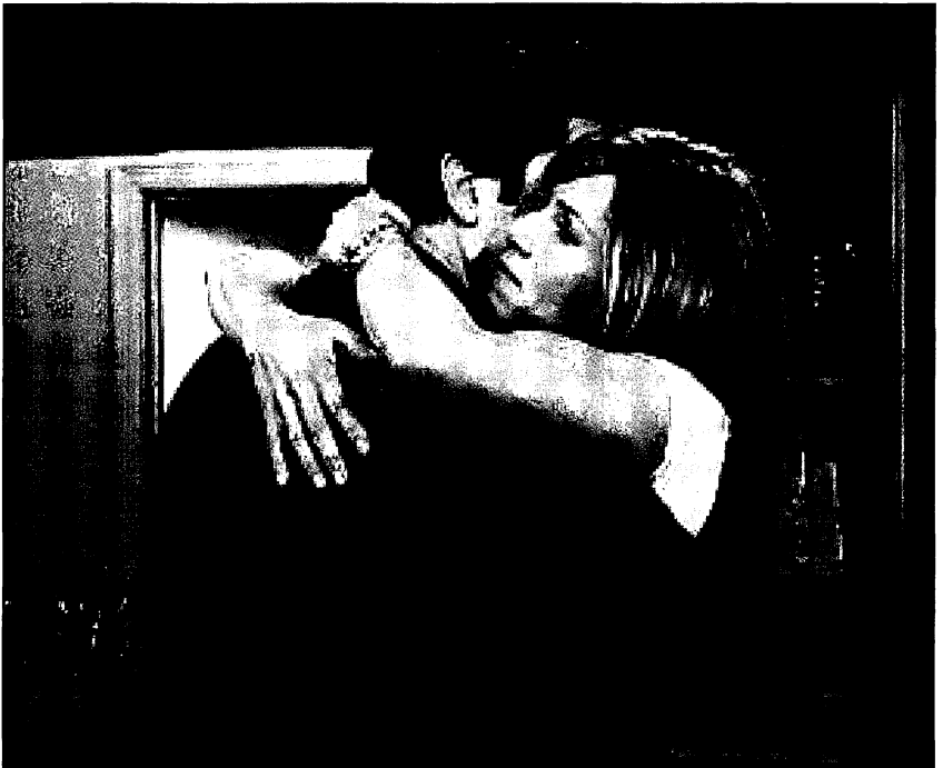
Figure 6: Rachel says goodbye to Ross.

Rachel's public act of forgetfulness and Carrie's public loss of consciousness are fitting metaphors for the disavowal of "the changing shades of light and dark," or for resistance to the psychological pressures to conform to the collective performance of national unity and to the state's insistence on a simplified "us vs. them" narrative with which to make sense of the new national order that arose after the World Trade Center attacks. Like Rip Van Winkle's 20-year nap, Carrie's swoon becomes the fundamental American physiological response to the ideological stress that is sub-textualized in Alek's invitation to resume Vincente Minelli's dance of empires, past and present, with New York's Lincoln Center here providing the impressionistic backdrop for the unnatural romance of political antagonists. Her collapse expresses a short-circuiting of impulses, a conflict which simultaneously reaches for the hand of the other while performing the compulsory loss of memory—not of the past, but of the present moment—that was the traumatic basis of post 9/11 national consensus building. This performance circumvents the alienating dilemma of having to see oneself through the eyes of a world outside—a world that acknowledges evil, and yet still dances. And ultimately, Carrie does dance with Alek, although it only after she has changed the set and positioned Alek under the harsh fluorescent lights of a