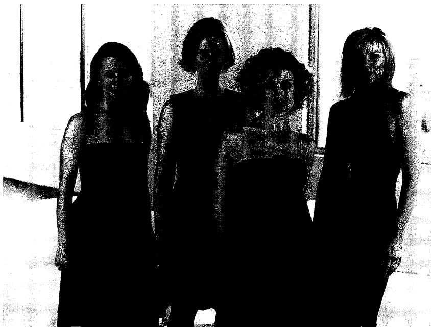
Figure 3: The cast of “Sex and the City” (from left to right, Kristin Davis, Cynthia Nixon, Sarah Jessica Parker, and Kim Cattrall).