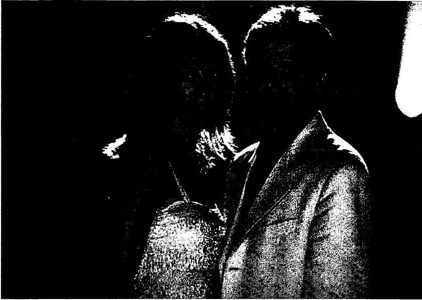
Figure 5: Carrie Bradshaw and Aleksander Petrovsky (played by Mikhail Baryshnikov).

visit whenever he wishes. At first, Ross bravely offers his support, especially when Rachel admits that this job is important to her and asks her friends to “try to get on board.” 28 But privately Ross admits, “How can I be okay with this?” Unable to accept the thought of “not being able to see her everyday,” Ross secretly brokers a deal with Rachel’s ex-boss to have her reinstated in her old position with a raise. When Rachel perplexedly tells him that she’s just been rehired, Ross senses her hesitation and asks, “You’re excited, right?”