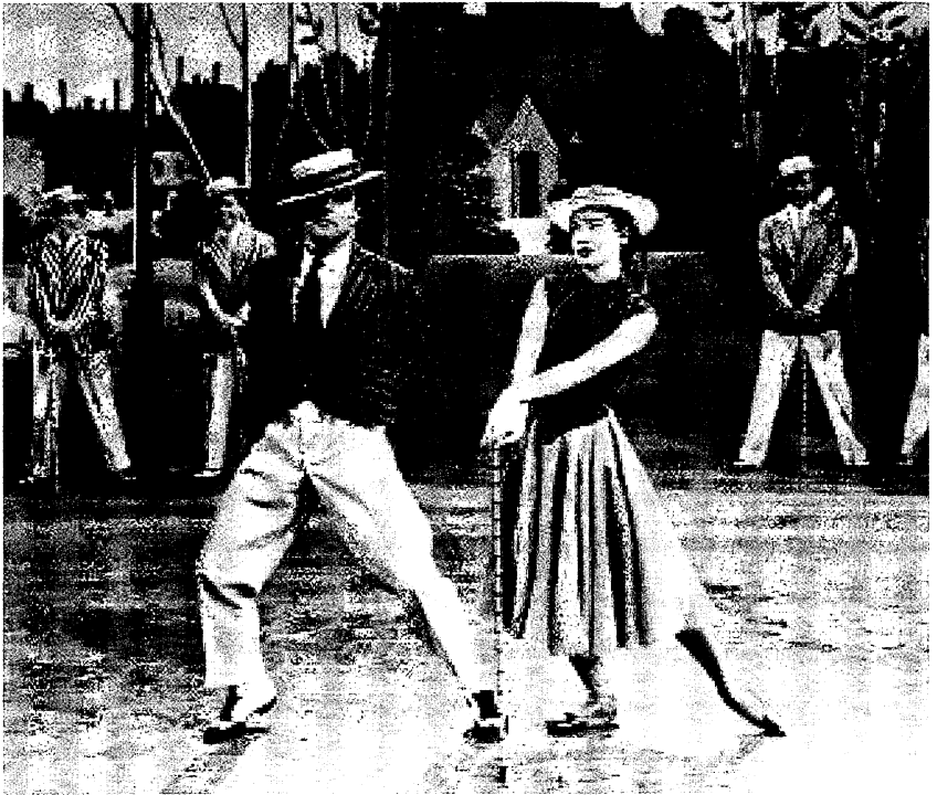
Figure 2: “Ballet,” Gene Kelly and Leslie Caron.

The opening ballet sequence in particular, which features Kelly at the Place de la Concorde, is a kaleidoscopic projection of historical discourses of desire (figured as alluring French vixens), militarism (the advancing French army), imperialism, and colonialism (in the form of a lone African in exotic native dress who interrupts Kelly’s exuberant romp across the plaza with a fleeting, ominous glare) onto the monumental simulacra of Paris Disneyfied. Kelly’s wide-eyed wonderment functions as an assertion of American innocence. His