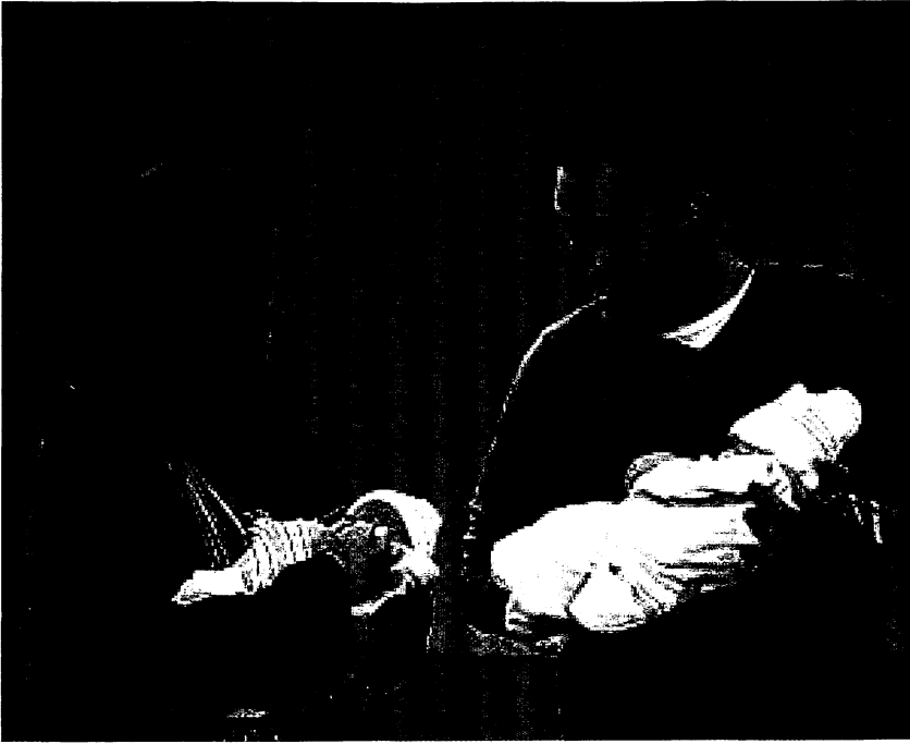
Figure 9: Chandler and Monica, parents at last, with adopted twins.

Brad Pitt defined the discursive parameters within which Friends fans were encouraged to bring closure to this chapter in television history and, at the same time retain an emotional connection to the female celebrities whose lives would now presumably enact the fantasies of familial validation that they performed on the set.