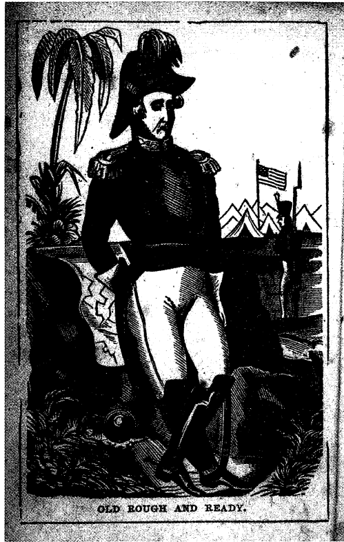
Figure 2: Sketch of General Zachary Taylor, Old Rough and Ready, from the Rough and Ready Songster .

of the Mexican male. It is not enough for Anglo soldiers to turn suitor and woo Mexican women, they must test their mettle on the battlefield as well. White male panic turns Mexican foes into one of two images: the fearsome, barbaric heathen represented by Generals Santa Anna and Ampudia, who rape women and order decapitations, and the effete dandy, also represented by General Santa Anna, whose moral character and fortitude have degenerated through overindulgence in luxuries. The rhetoric surrounding the U.S.-Mexican War, which manifested itself in contradictory attacks on the enemy's masculinity, reappeared over fifty years later in the Spanish-American War, targeting Spanish soldiers. In Kristin Hoganson's analysis of the gendered politics towards Spain that attended the Spanish-American War, she writes of the seemingly contradictory attacks on the enemy's masculinity: "Like the stereotypically savage Spaniards, the seemingly childlike and feminine Spaniards seemed to exemplify perverted gender roles." 65