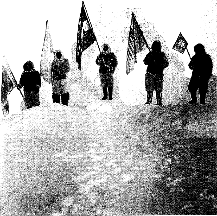
Figure 1: Another image for this series, Peary's famous photograph of hoisting flags at the pole, including the North Pole flag.

expeditions northward. . . ." 85 As if to compensate for the lack of verifiable evidence in his narrative, the explorer literally wrapped himself in the Stars and Stripes.