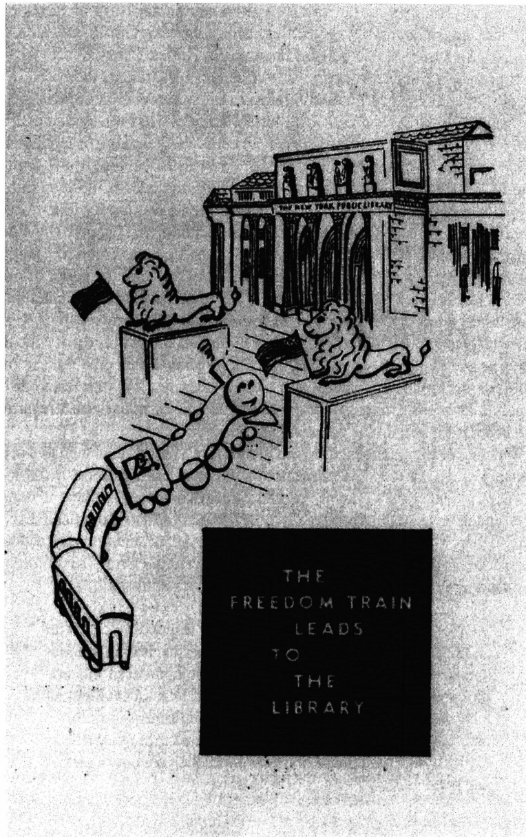
Figure 1: A brochure invited the public to follow a visit to the Freedom Train with a trip to the New York Public Library. “The Freedom Train Leads to the Library.”