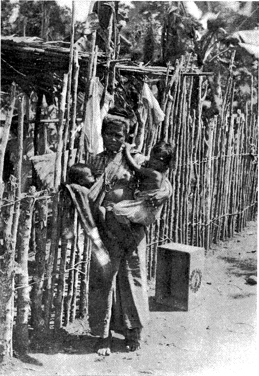
Figure 1: From Dean Worcester, “Notes on Some Primitive Philippine Tribes” in National Geographic Magazine June 1898, page 297.