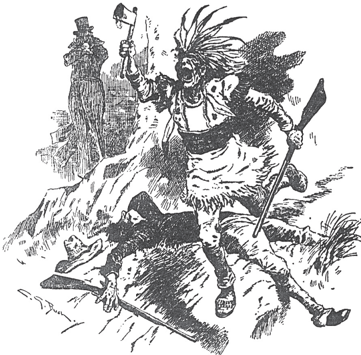
UNCLE SAM: “Speaking of annexing nine million more savages——”

Years ago . . . I thought that I could whip the whole United States, but since I have been around the country I have changed my mind. . . . There is no country that can whip the United States and what is the use of a few hundred Indians starting in to undertake the job. Since coming to Omaha I have learned that the white men are more numerous than the leaves on the trees.