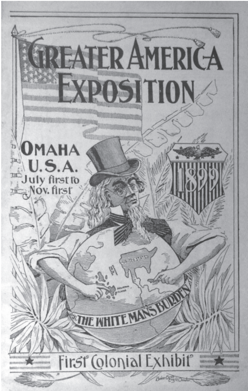
Figure 5: Cover of a publicity pamphlet for the Greater America Exposition in Omaha, 1899. (From the personal collection of Jeffrey Spencer).