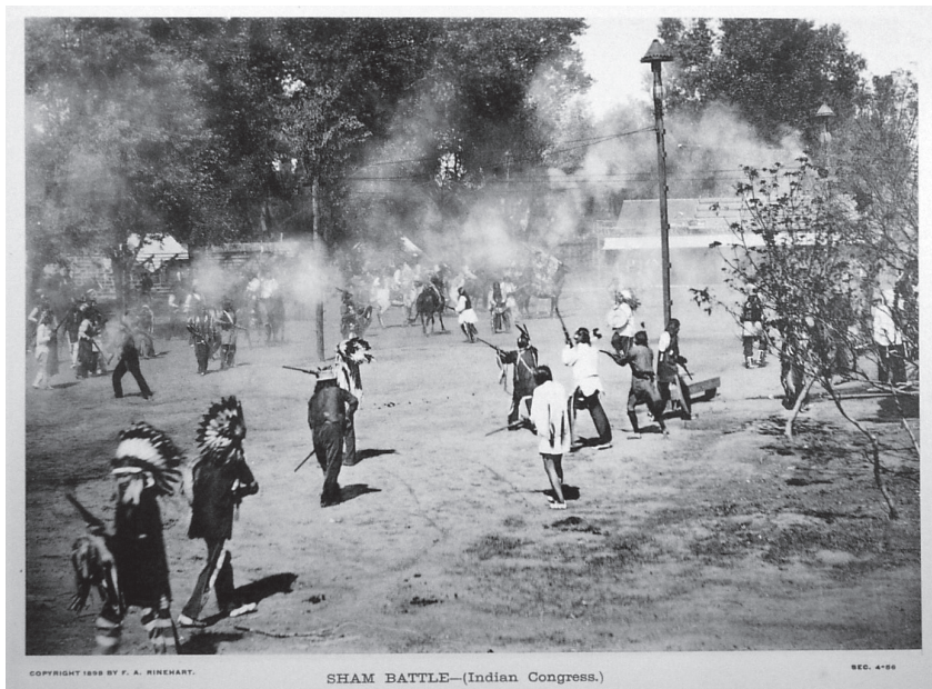
Figure 3: Indian Sham Battle at the Omaha Exposition. Published in Photographs of the Trans-Mississippi and International Exposition, Held at Omaha, Nebraska June 1 st to November 1 st , 1898 . (F. A. Rinehart, 1898).

distinguished warriors to partake. The Omaha Bee reported, “After the dog had been killed... half a hundred young Indians who had never tasted dog, sat around and begged for even a drop of blood.” 32 The dog feasts, battles, and war dances, some argued, transformed the Indian Congress into a wild west show, so much so that the Wild West Show concession at the exposition sued fair management for allowing the Indian Congress to steal its act.