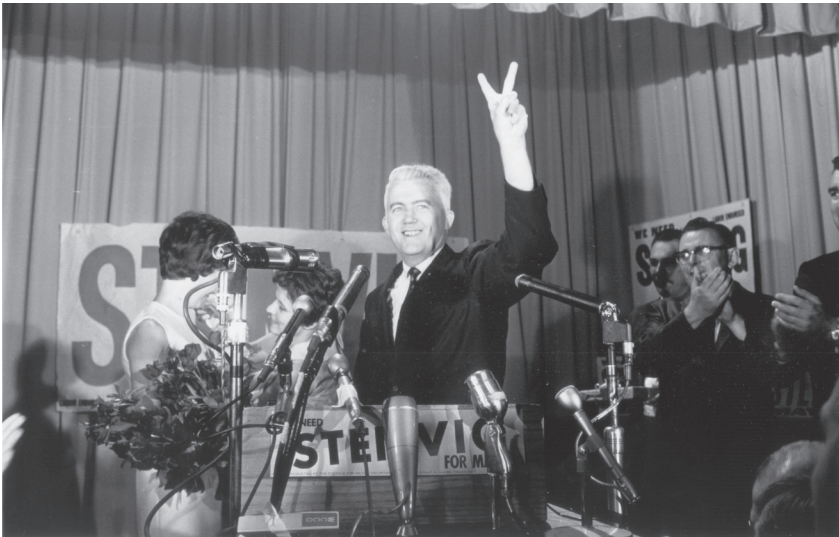
Figure 1: Minneapolis Mayor Charles Stenvig at a victory party.

In addition to highlighting the rise of law and order mayors in the 1960s and 1970s, this article focuses on how Stenvig successfully opposed liberalism's reliance on social scientific explanations to address issues such as crime. Stenvig's idiosyncratic brand of populism proved immensely popular with voters when compared to the technocratic expertise of the liberal politicians whom he