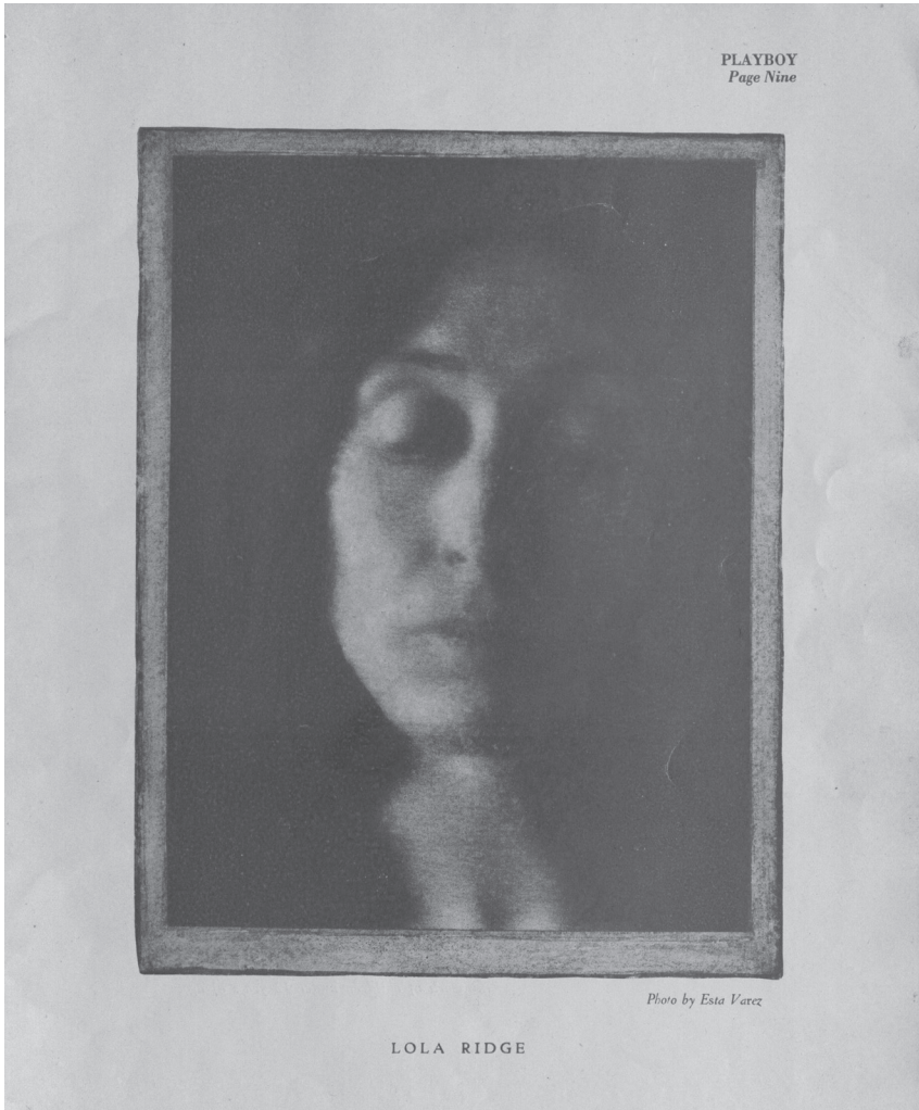
Figure 1: A photograph of poet Lola Ridge, taken by Esta Varez, published in ‘Playboy: a portfolio of art & satire’ (no. 1, 1919). Courtesy of the Bryn Mawr College Library Special Collections.

both American and modernist studies, the work of Lola Ridge certainly demands more serious scrutiny. 3