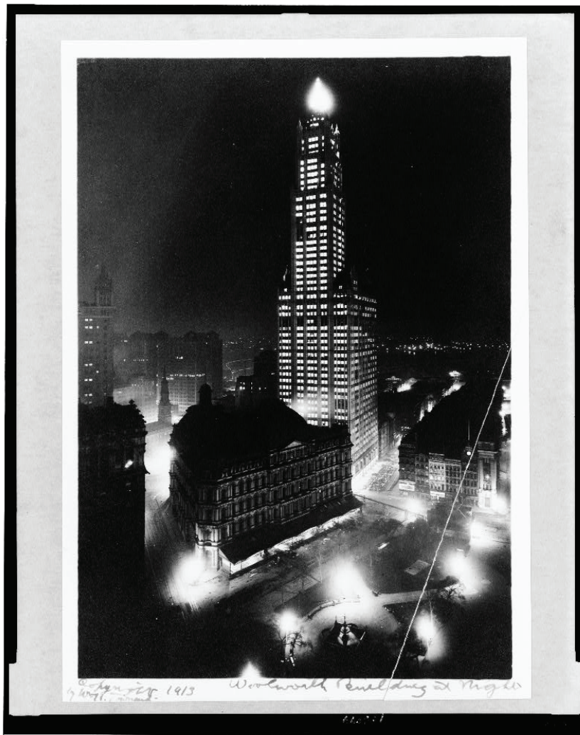
Figure 3: The Woolworth building at night, 1913.

“Spring” and “Bowery Afternoon” present an ambivalent critique of urban life. They are snapshots of modernity’s contradictory fragments, at once colorful and dull, eye-piercingly bright and obscurely menacing.