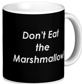
Figure 1: A “Don’t Eat the Marshmallow!” coffee mug, currently available at http://www.zazzle.com . Image reprinted by permission.

publication of Richard Herrnstein and Charles Murray’s The Bell Curve: Intelligence and Class Structure in 1994.