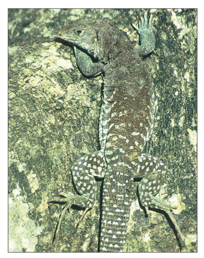
Figure 1. Ameiva plei is widely distributed on the Anguilla Bank.

xeric. One site (Cinnamon Reef) was in a resort area, where decorative landscaping involved some localized watering, but prevalence at this site was very low.