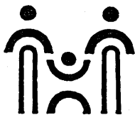
FIGURE 4 Parent Tips for School Conferences