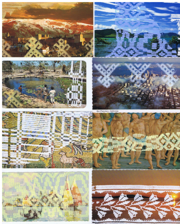
Image 11. Da(r)sha Golova, Postcards of Solidarity. (Second Edition) (2021). Screen-printed paper. Amsterdam, Netherlands.

Postcards of Solidarity , another work from the same exhibition, is an ongoing project developed by Amsterdam-based artist and designer Da(r)sha Golova (in collaboration with Masha Maroz, Artemiy Sei, and Sasha Kulak). The exhibition's introductory text states that political problems in modern Belarus are directly related to the destruction of the Belarusian ethnic heritage: "The majority of Belarusians don't know their roots, culture and are ashamed of the Belarusian language, considering it 'peasant-like.' That is one of the reasons why we, as Belarusians, have been asleep as a nation for a long time and are now seeking the process of building and forging a new structure between us as humans, repairing connections between the land and people" [Golova et al 2021]. Golova's mail art project (see Image 11) features two editions of postcards from European cities with traditional textile patterns from Polesia printed across them. The patterns come from Maroz's Past-Perfect archive. According to the artists, such superimposition of West European and Polesian images advance the "reparation of liaisons within the family, the reconnaissance of ornamental language, the