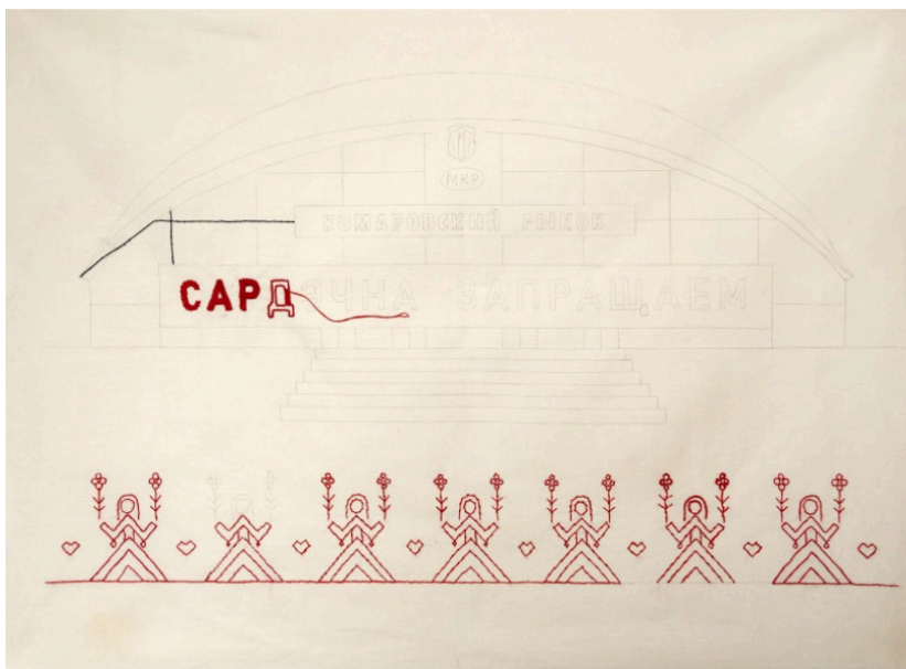
Image 6. Anonymous, Tomorrow is Every Day (2020). Communal documentary embroidery. Minsk, Belarus.

[...] больш за дзесяць мастакоў і мастачак прапанавалі свае эскізы для сумеснага стварэння рукатворнага дакументальнага палатна-вышыванкі, у якім можа прыняць удзел кожны з вас! Акрамя таго, што мы разам з вамі ставарем буйны твор мастацтва, працэс вышывання - вельмі добрая тэрапія і медытацыя, каб перажыць і асэнсаваць усё тое, што нас кранае