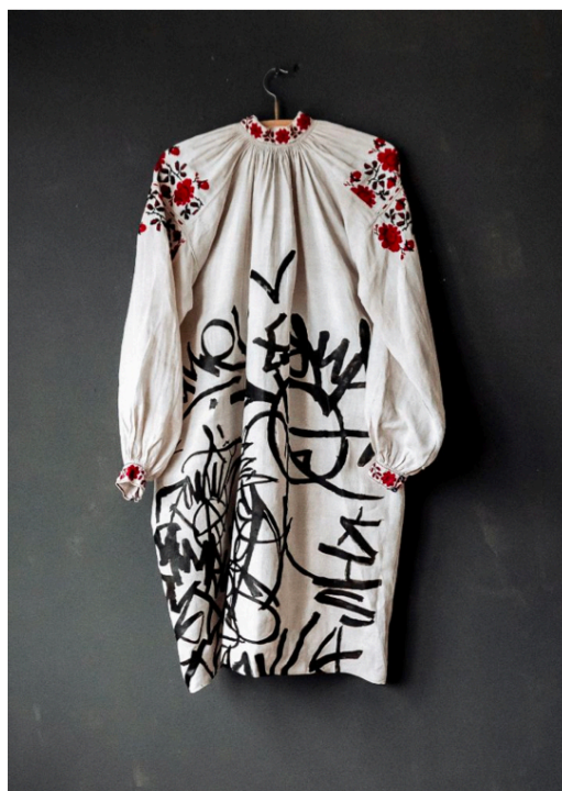
Image 1. Cemra, Spadchyna (2019). Fragment of a triptych. Embroidered home-spun Belarusian dress with elements of graffiti. Hrodna, Belarus.

Background: Embroidery in Belarusian contemporary art