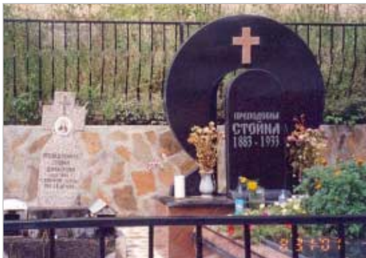
Venerable Stoina's Old and New Gravestones

"The saint, however, did not let herself and her holy deeds be completely forgotten," reads her vita. In the 1980s she started "appearing" in the dreams of various people in the district with specific instructions: to restore her tomb, bring people there and write her vita. The folk veneration of Stoina began to mushroom.