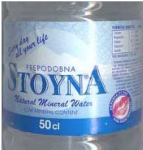
“Prepodobna [Venerable] Stoina” Bottled Mineral Water

All the available variants reveal the deliberate intention to follow the hagiographical canon, although they are far from being paragons of the genre. The later copies reflect a tendency to increase the cohesion of the text by following more closely the chronology of related events, by introducing leitmotifs (e.g. the perceptible accumulation of vocabulary based on the Slavic root *svet-, “light”), and by framing the episodes with admonitory formulae borrowed from the language of the liturgy. The text not only describes itself as a zhitie [vita], but also functions as one. It is read aloud as a sermon by priests at Stoina’s tomb on her commemoration days as well as after the Holy Liturgy in St. George’s Church in the town of Petrich. The elderly women from Zoia’s circle also often read it aloud when they meet, always making the sign of the cross before the reading, as