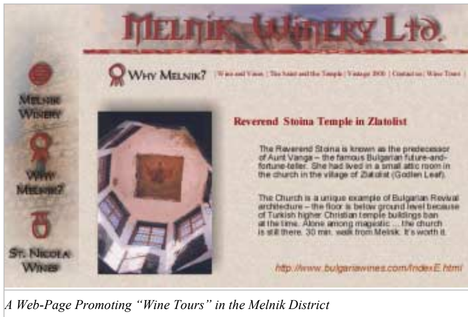
A Web-Page Promoting "Wine Tours" in the Melnik District