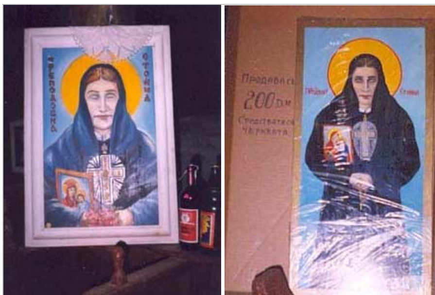
Two icons of the Venerable Stoina, the second for sale at € 200

Various miracles have happened at Stoina's tomb signifying her posthumous saintly status. According to her vita a halo may appear around it, with Stoina herself "seen" coming out of the grave to cure pilgrims. Those who are disrespectful to the tomb are severely punished. Soon after she passed away two men tried to destroy her tomb "out of primitive atheism." One of them immediately became insane; the other one later died by accident. "You must not attempt to harm a saint," concludes the account of the episode in the vita instructively, "because God punishes you according to your deeds."