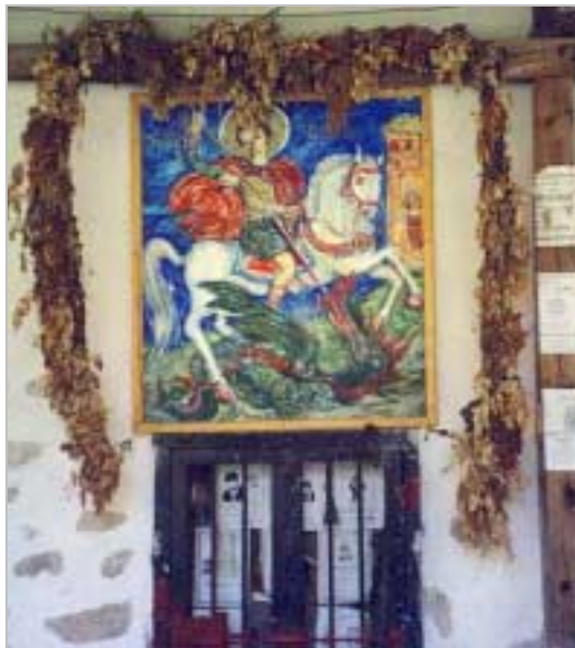
The "living" St. George guarding the entrance to Sushitsa's Church

Everything in the daily routine of this extraordinary hermit woman was also unusual. She ate only communion bread and dressed like a nun only in black, although she never took the veil. Peasants from Sushitsa led her around the district to preach, and people came to her to confess their sins, as if she were a priest and not an illiterate woman. Above all, however, she was distinguished by her "gift from God," allowing her to see things beyond the range of normal. She recognized people "from their breathing," called total strangers by their names, knew without explanation why somebody was visiting her. People came to learn secrets from the past and events of the future, to get advice on communal or personal problems, or to satisfy their curiosity about the end of this world and life in the next.