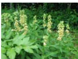
5. Lat. Digitalis Grandiflora ; Eng. Yellow Foxglove; Alb. Lulemadhi (Big Flower).