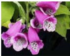
3. Lat. Digitalis Purpurea ; Eng. Purple Foxglove ; Alb. Luletogzi i Purpurtë (Purple Foxglove)