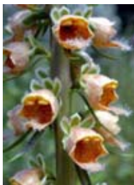
4. Lat. Digitalis Ferruginea ; Eng. Rusty Foxglove; Alb. Lulendryshku (Rusty Flower)