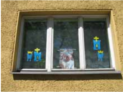
A residential window in Wadowice. The 'M's are handmade representations of John Paul's papal insignia. May 22, 2006.