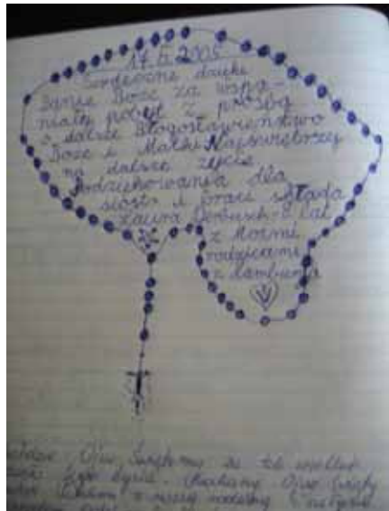
An entry in a book in the Polish Home. May 10, 2006.