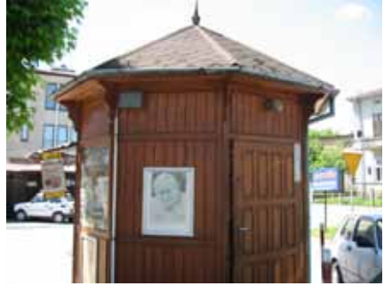
A portrait of John Paul on an outdoor kiosk in Wadowice. May 22, 2006.