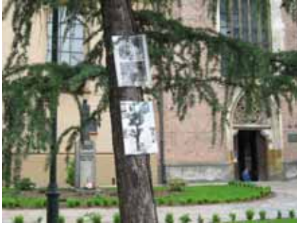
Newspaper clippings outside the Franciscan Church in Krakow. May 23, 2006.