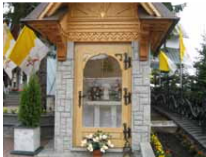
The 'Santo Subito' – 'A Saint Quickly' Shrine, Zakopane, Poland, May 28, 2006.