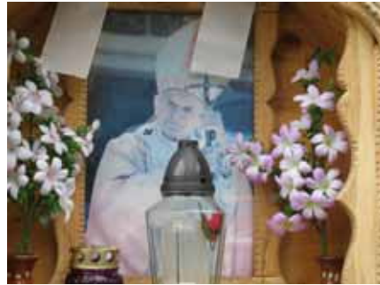
The John Paul 'wayside shrine', found in the town of Zakopane. The shrine is built in a 'traditional' highland fashion.