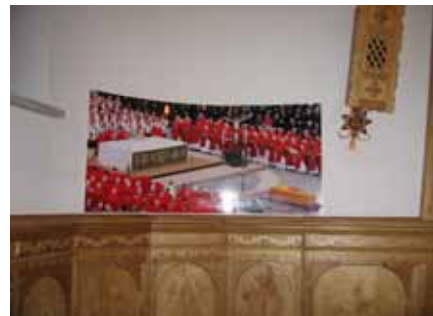
Photographs of the funeral in Rome, on the walls of the Church of the Fatima, Zakopane, Poland, May 28, 2006.