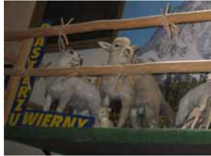
Text (which reads 'Faithful Shepherd') in Wadowice's Minor Basilica, where John Paul was baptized and received his first sacraments. May 22, 2006.