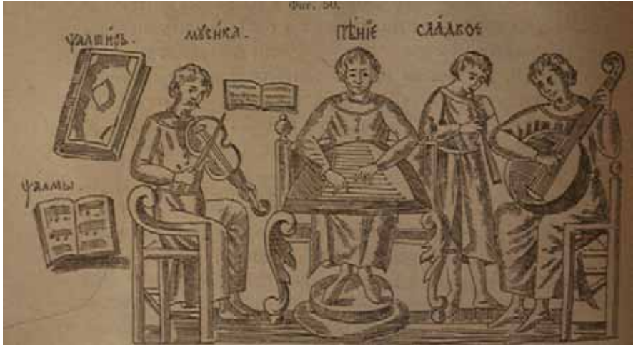
Musicians from Karion Istomin's Bukvar'

connected with Muscovy, this illustration does not warrant much attention in the discussion here.