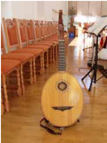
Six-string kobza used in the National Bandurists Cappella of Ukraine

Indeed, these instruments have found a place even in the National Bandurists Cappella of Ukraine, but not as equals. They were in back rows, and when bandura players would turn their instruments toward the audience during applause, the kobza players lowered their instruments, as if they were ashamed of them. At least that was the picture during the cappella’s Canadian tour in 1988.