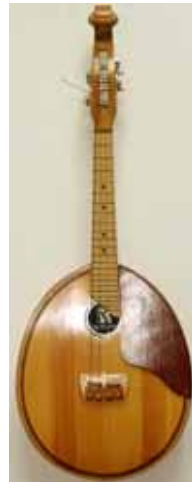
Four string modern kobza