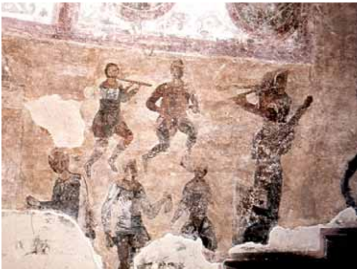
Minstrels. St. Sophia Cathedral in Kyiv, 11 th c.

The earliest documentation in Ukraine of an instrument from which the kobza and bandura could have evolved is an eleventh century fresco in the northwest staircase of St. Sophia Cathedral in Kyiv.