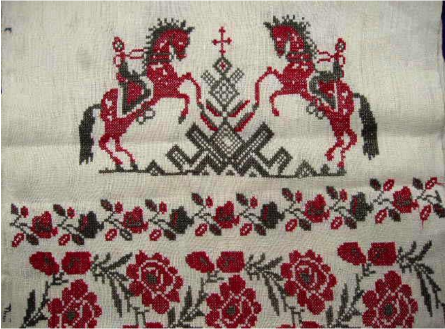
A curious late version of an abstracted Goddess, surmounted by a cross, and surrounded by her galloping retinue (Ukraine, mid-20 th c.; author's collection)

Ceremonial towels were integrated into all family-rituals. Rushnyky were used to welcome new-born infants, who were wrapped in them. A linen cloth was “one of the main ways of marking the transitional state of a new-born... A piece of linen was the necessary ritual object” to be used when baptizing an infant. The cloth symbolizes “the world of culture in which the child entered from the world of nature.” This cloth would be preserved to make a wedding towel, and wedding towels were preserved for funeral rituals, when they were placed in the coffin or tied to a grave cross [Lysenko 1992; n. p.].