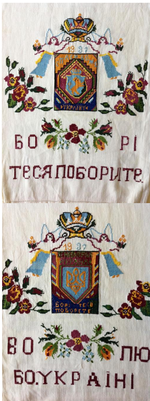
Embroidered rushnyk (from Sokol' raion, L'viv oblast', dated 1937, author's collection)