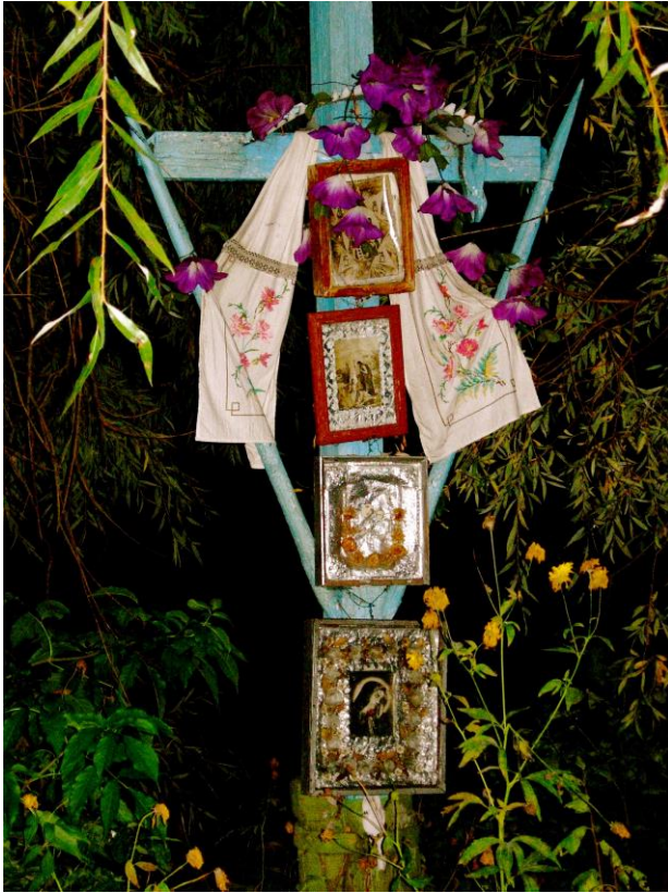
Cross decorated with a rushnyk and icons at the mouth of a fresh-water spring regarded as holy

(Bazaliya, Khmel'nyts'ka oblast' , 2005)