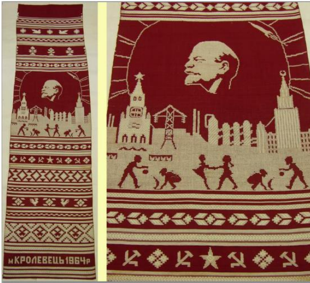
Krolevets' woven panno (1964; author's collection)