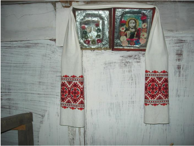
Typical display of icons with a draped rushnyk , Villiage of Havrylivka school museum (Khmel'nyts'ka oblast' , 2007).