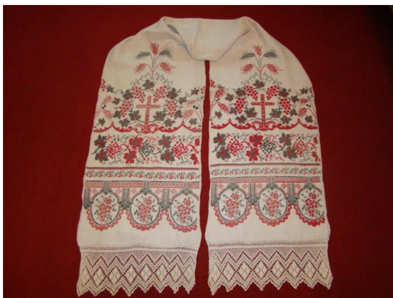
A cross that blossoms with grapes and wheat (Central Ukraine, mid-20 th c.; author's collection)