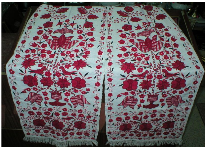
An exuberant Tree of Life in a vase, surrounded by birds (Cherkasy region, Ukraine, mid-20 th c.; author's collection)