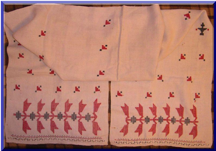
Funeral rushnyk with flying birds, the symbol of transition to the “Other World” (Ukraine, mid-20 th c.; author’s collection)

trance states when he guides the lost souls of the dead to their rest. In the Ukrainian funeral ritual, the use of rushnyky function in a similar way. They create a magical pathway to the world of the dead and thereby help lead the soul of the dead to repose. In some regions of Ukraine, the coffin was lowered into the grave on long woven rushnyky , which, according to folk belief, symbolized the road to the “Other World.” “The rushnyk was placed not only on the coffin but also inside [it], since people believed that the angels used the ritual cloth to carry the soul of the deceased to heaven” [Wolynetz 2005: 32].