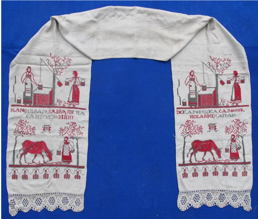
Rushnyk with inscription (Chernihivske Polissia, 1920s-1930s, author's collection)

is from northern Chernihiv region (Chernihivske Polissia). I purchased this