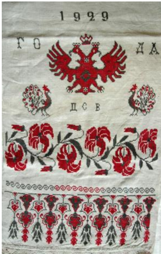
Rushnyk (Central Ukraine, 1929; author's collection)

The motif can be attested in the Soviet period as late as 1929, in a dated rushnyk from Central Ukraine in which two peacocks (a common motif on wedding towels that symbolizes beauty and prosperity [Kononenko, http://www.arts.ualberta.ca/uvp/pages/media/rushnyky/index.htm?menu=4-2:1 ] escort the crowned double-headed eagle in the composition that usually depicts two birds surrounding the Tree of Life.