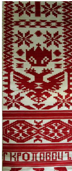
Kroloverts' woven rushnyk , (ca. 1900; author's collection)

Charlampus Convent in Chernihiv region; preserved in the Tarnovs'sky Chernihiv Historical Museum [Zaichenko 2010: 62-63, 148-151]), which date to 1715-1722. The Imperial Russian heraldic symbol is fully realized—both heads of the eagle are crowned, and it holds in its talons the Imperial regalia, the orb and scepter, clearly marking the Cossack Hetmans loyalty to the Tsar Peter I. Numerous later examples of fully detailed double-headed eagles with Tsarist regalia from central Ukrainian provinces can be found on the website of the Ivan Honchar Museum (Kyiv). (5) The motif was widely employed in simplified form in the woven rushnyky produced in large numbers in Kroloverts' (Sumy oblast' ) artels in the late nineteenth-early twentieth centuries. The crowns are highly stylized, and the orb and scepter are usually omitted. Thus the eagle loses some but certainly not all of its Russian Imperial symbolism. In contemporary Ukrainian studies it is rarely acknowledged as a Tsarist motif, rather something on the order of the “silhouette of two eagles.”