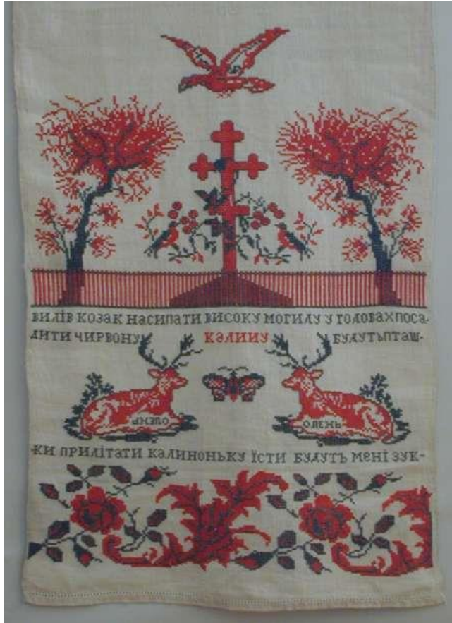
Rushnyk made to commemorate a dead soldier. (Central Ukraine, mid-20 th c.; author's collection)

The embroidered design indicates the grave mound itself, over which a cross has been erected and a kalyna (mountain ash or rowan) grows. The rowan represents longing and healing, and is often depicted on towels for soldiers killed in battle and other “unquiet dead”; the berries indicate fertility and thus the possibility of regeneration. All the elements possess specific symbolic meaning: the deer are a motif of resurrection (the steppe peoples also regarded the deer as a conductor of souls) and the butterfly—the departure of the soul. Birds are often understood to be agents that can assist the dead in communicating with the living. (4) Here