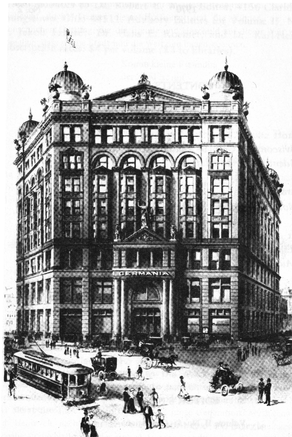
Germania-Gebäude in Milwaukee Wis. Das größte deutsche Zeitungs-Gebäude der Welt.