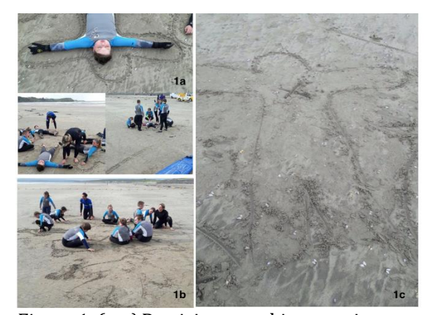
Figure 1. (a-c) Participants taking part in a body mapping exercise before surfing.

During BM1 participants formed a circle on the beach and took it in turns to draw a large outline of their body on the sand. Lying down, participants were invited to take a few moments to focus on their breathing, bringing their awareness into their bodies, noticing how their bodies felt on the in-breath and out-breath (see Fig. 1a). This helped to settle and relax the group although some children found it difficult to be still and others preferred to sit instead of lie down. After the 'body scan' visualisation, participants created their personal body maps drawing on the surface of the sand or using items found on the beach space such as pebbles, shells, feathers and plastic bottle caps to symbolise different sensations and feelings. For one to two minutes each, participants took it in turns to share their bodymaps with each other while the facilitator moved between the groups observing the interactions (Fig. 1b). Everyone returned to the large group circle to share their responses to the prompt questions.