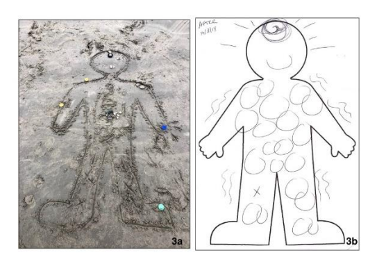
Figure 3. (a-b) Before (a) and after (b) collective body maps

nuanced it did provide a more rapid and accessible way to integrate body mapping as part of the lesson plan and to capture bodymind experiences immediately after surfing before participants got too cold. It also illustrates the collective energy and emotional state of the group as a whole.