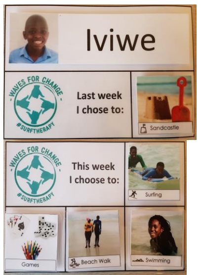
Figure 5. Example of a 'choosing' card