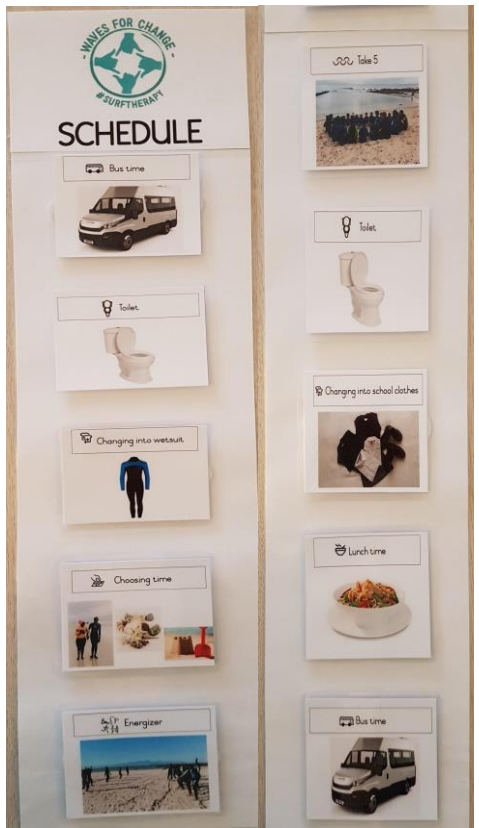
Figure 4. Visual schedule/structure of a surf therapy session