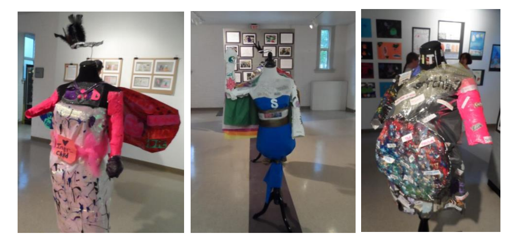
Figure 1: Shero mannequins created by CBAI FJO participants

were victims of bullying. This Shero also had a more intimate and personal component because, as one of the artists explained, it represented an inner-child. The mannequin represented a complex juxtaposition between becoming a protector and resorting back to childlike innocence. The portraval of a Shero as both an innocent child and a protector of innocence is incredibly powerful given that many FIOs indicated that they served as an adult caretaker in their families. Though each mannequin took a different approach, each depicted complex responses to the challenges facing FIOs and demonstrated powerful attempts to work together to redistribute power. Figure 1 illustrates mannequin work completed by participants.