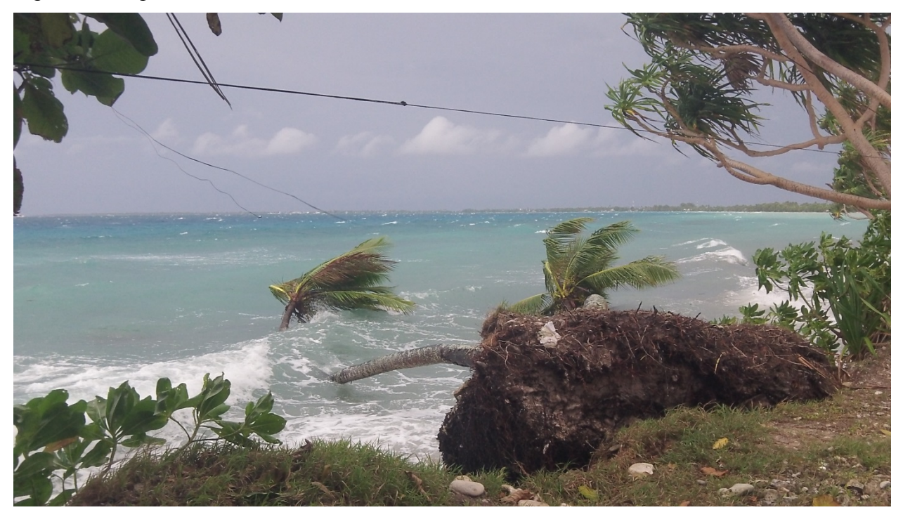
Image 2. Coastal erosion in the Funafuti atoll, associated with high tides and sea level rise. (Corlew, 2013).

with emission reductions and assist small island states and other developing nations with expensive adaptations.