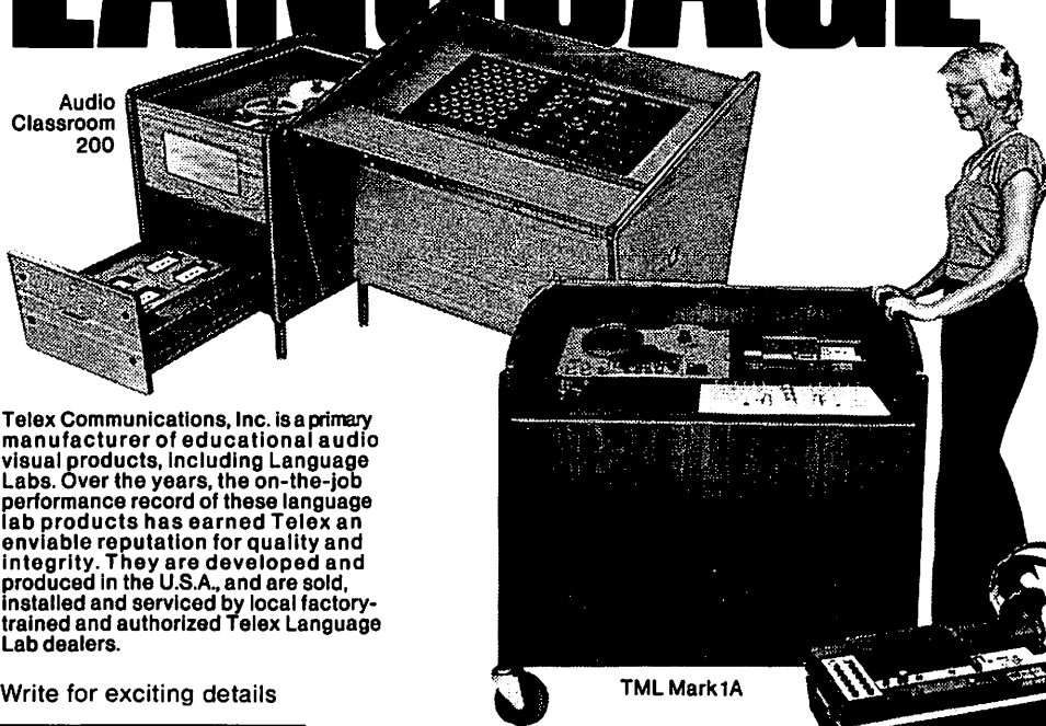
Audio Classroom 200

Telex Communications, Inc. is a primary manufacturer of educational audio visual products, including Language Labs. Over the years, the on-the-job performance record of these language lab products has earned Telex an enviable reputation for quality and integrity. They are developed and produced in the U.S.A., and are sold, installed and serviced by local factory-trained and authorized Telex Language Lab dealers.